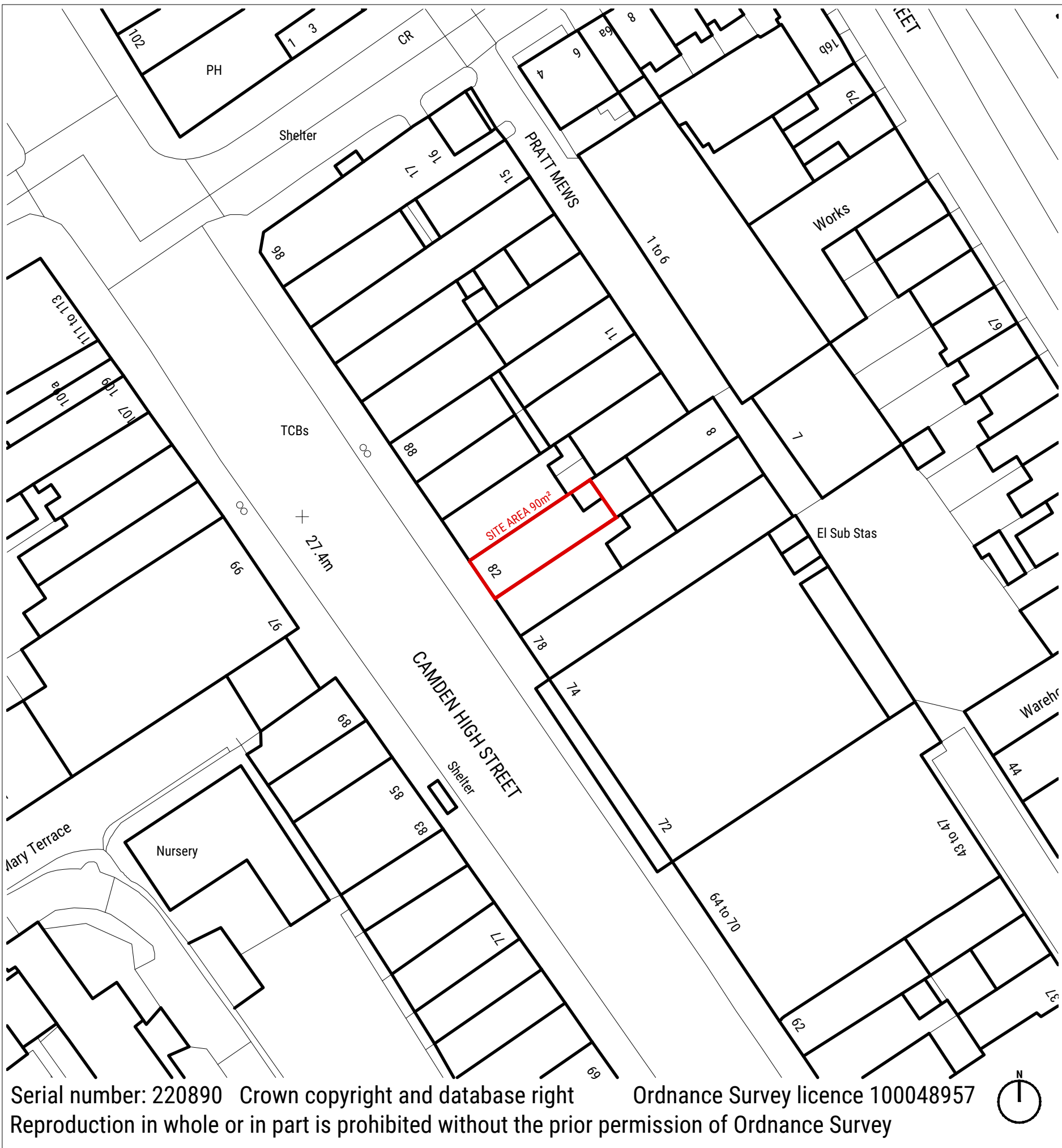
01 Location/Block Plan Scale 1:500@A1