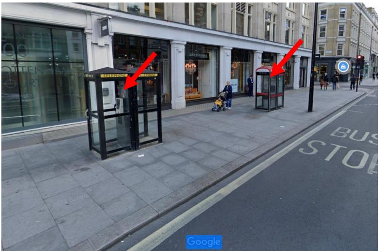
Image 2: The footway currently has numerous existing Kiosks that won't be removed marked in red.