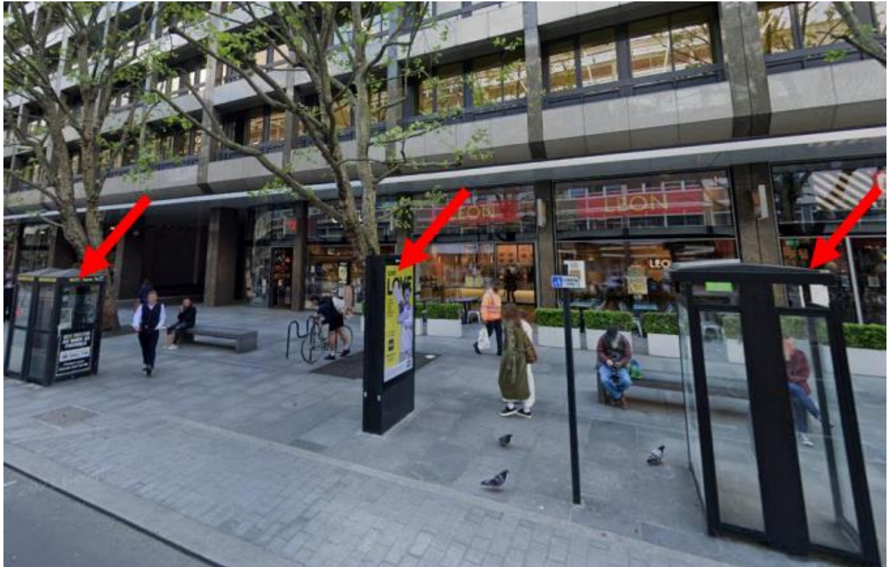
Image 2: The footway currently has numerous existing Kiosks, which will not be removed (marked with red arrow).