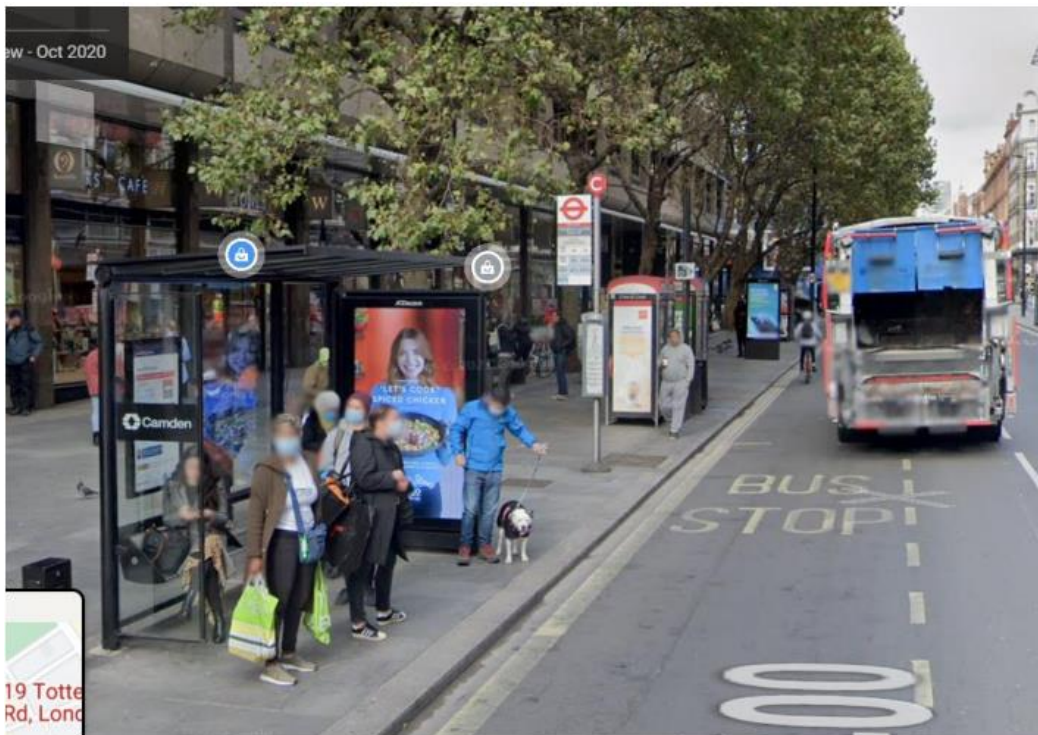
Image 2: The footway currently has numerous existing Kiosks and street furniture