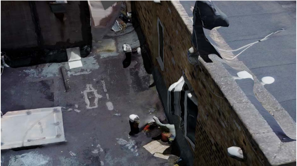
3D recreated proposed layout of 1st floor addition only: