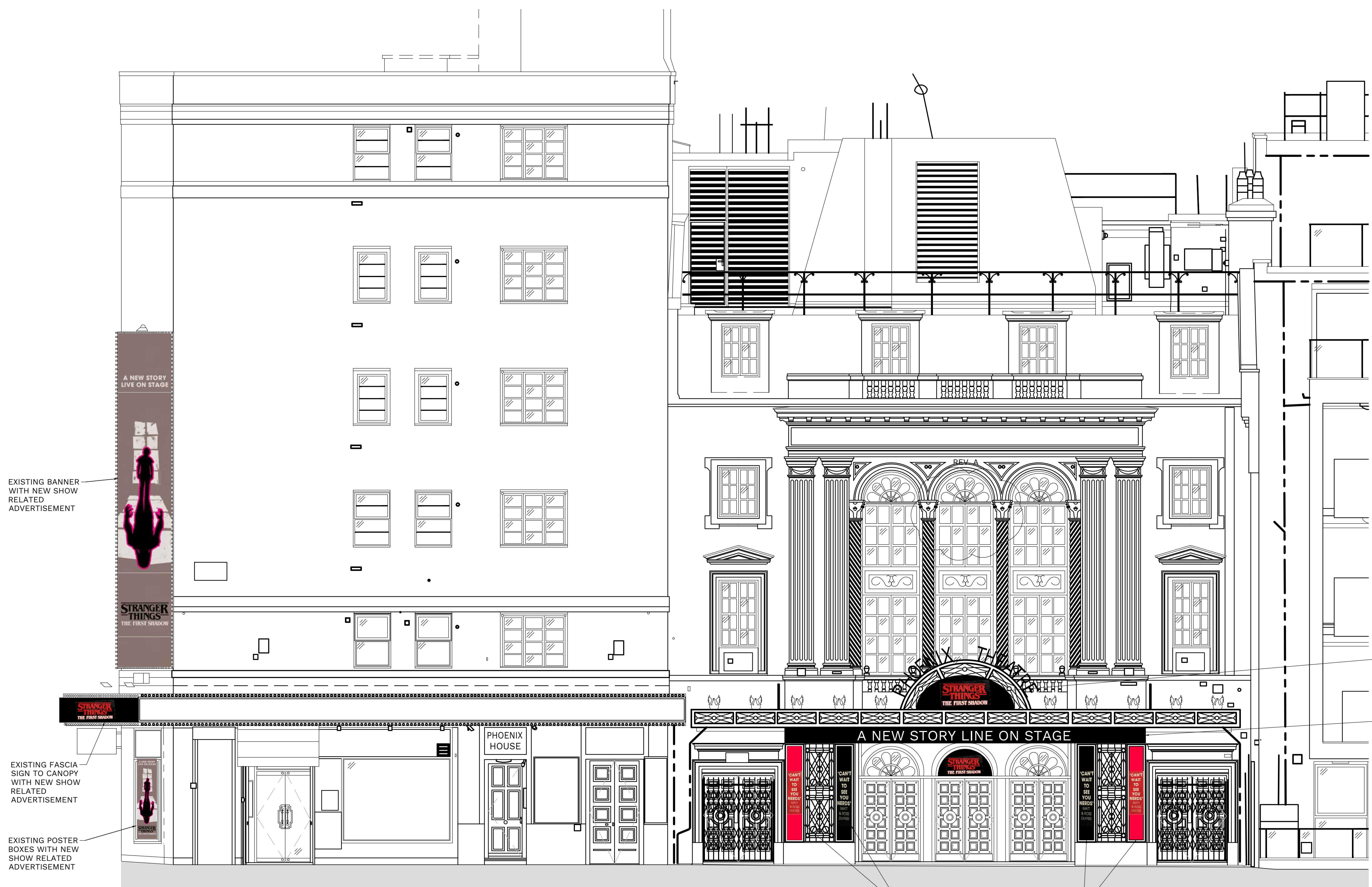
PROPOSED PHOENIX STREET ELEVATION (SCALE 1:50 AT A1)