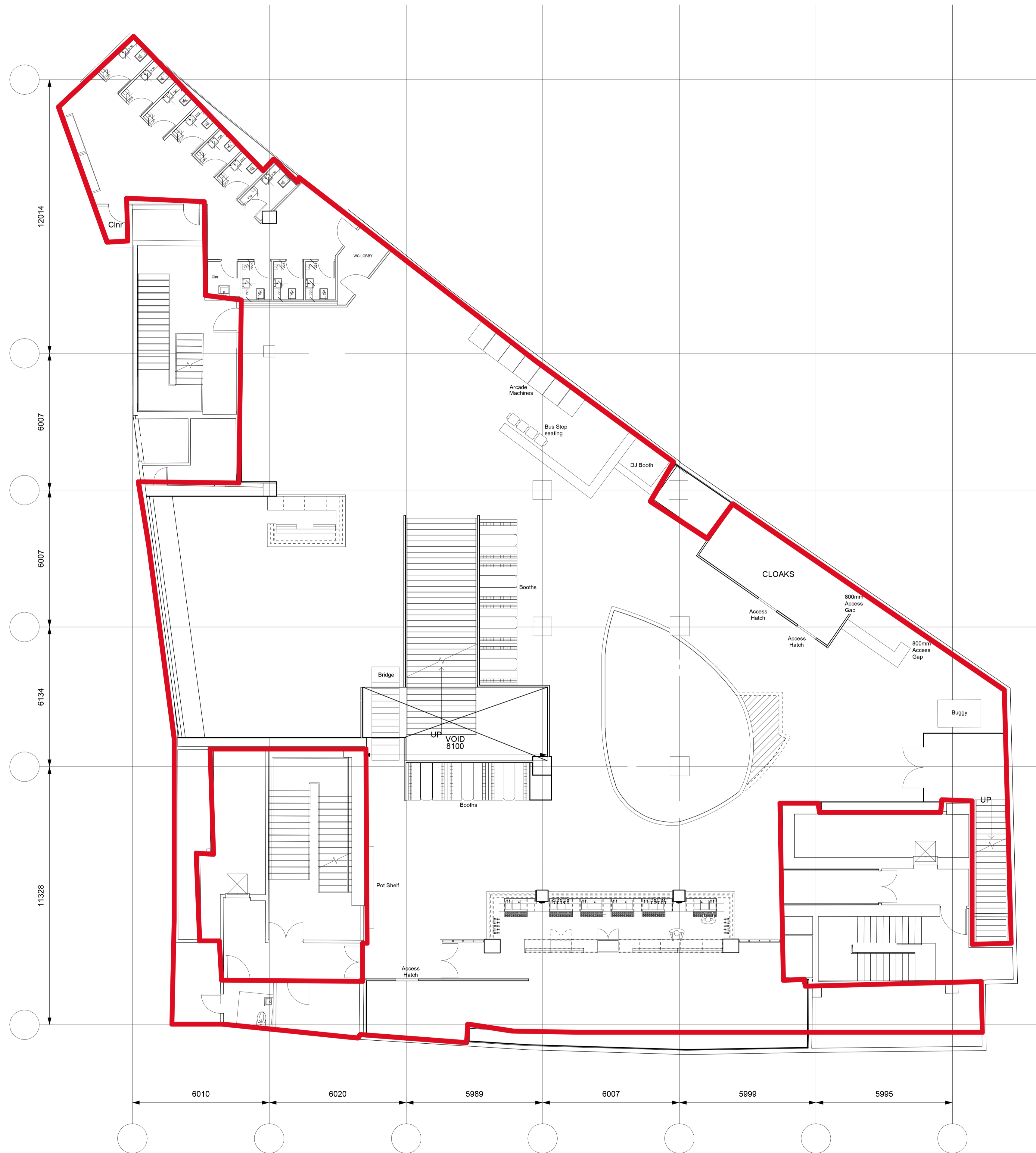
B01 GA REVISION C Scale 1:100