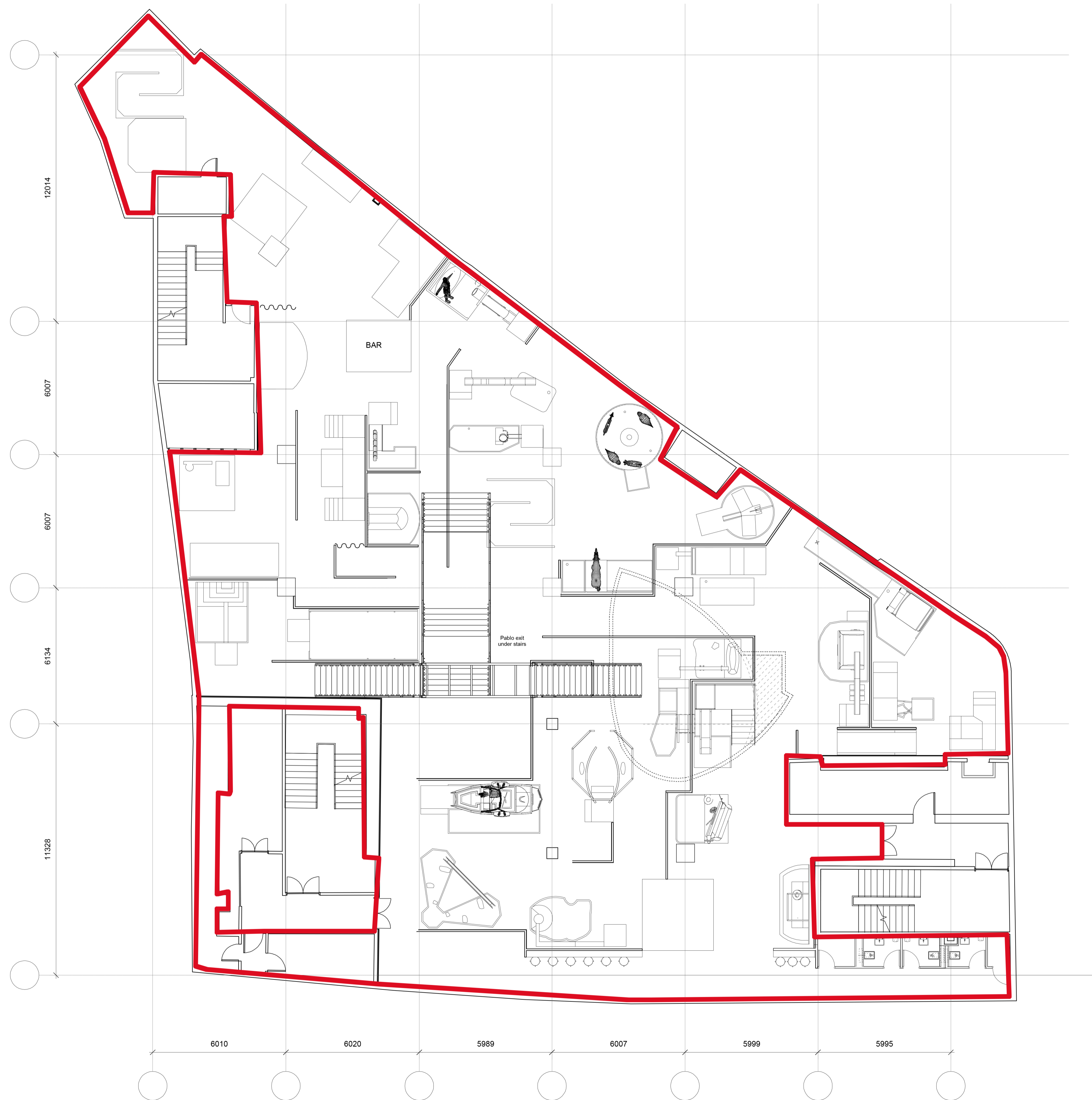
B02 REVISION C