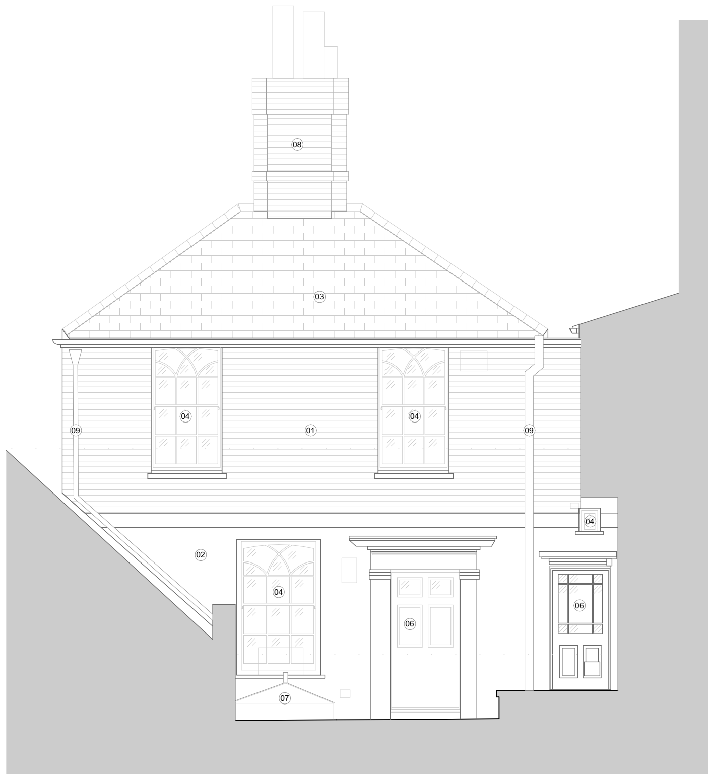
SOUTHEAST ELEVATION AS PROPOSED