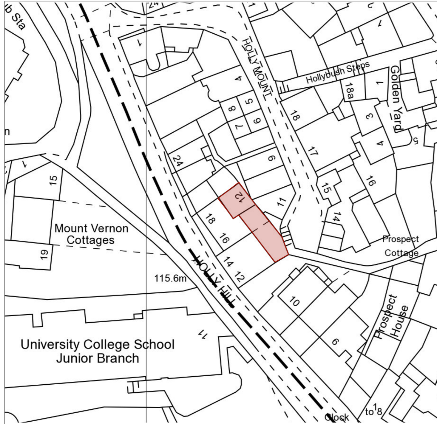
BLOCK PLAN AS EXISTING SCALE 1:500 @A3