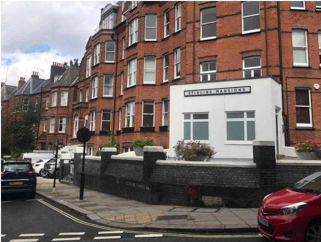
04 Site image