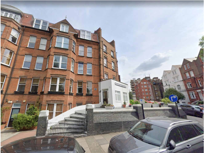
06 Site image

Unless indicated in status, this drawing is for information only. The Contractor to advise on all details and ensure stability and strength of construction. The Contractor to provide setting out drawings for approval prior to construction. The Contractor to check all dimensions on site and relate to these drawings. The Contractor to report any discrepancies to Designers prior to construction. All services to Local Authorities, BCO and Environmental Health regulations and to Service Engineers details. All structure to Structural Engineers details and Local Authority and BCO regulations. All construction and materials to comply with current Building and Fire Regulations. Drawings should be removed from circulation immediately a revised version is issued. No dimensions to be scaled from this drawing - use figured dimensions only. All dimensions to be checked on site, any discrepancies found between this drawing and other documents should be referred immediately to the consultants. All dimensions in mm. This drawing is Copyright 'ITO Lab Ltd.