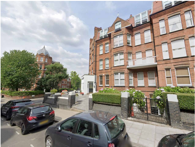
05 Site image