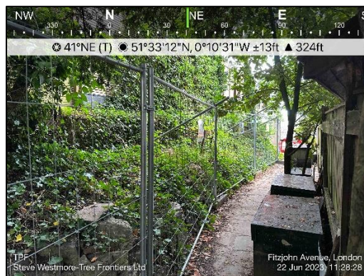
Plate 5 - TPF adjacent T3 and T5