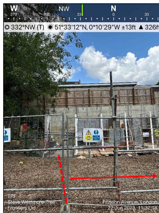
Plate 12 – Proposed TPF variation adjacent T10 (indicative relocation identified with red dashed line with area to right removed from CEZ)