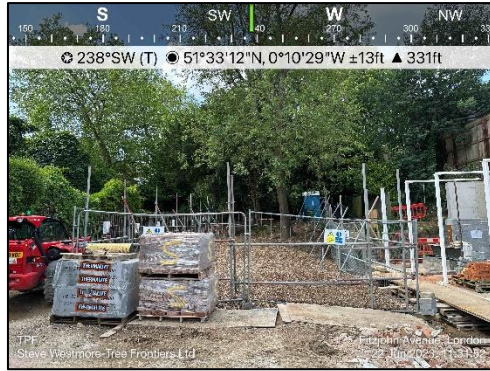
Plate 7 - TPF adjacent T10