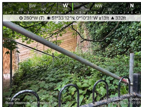
Plate 3 - TPF adjacent T2