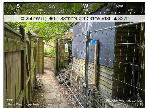
Plate 4 - TPF adjacent T3