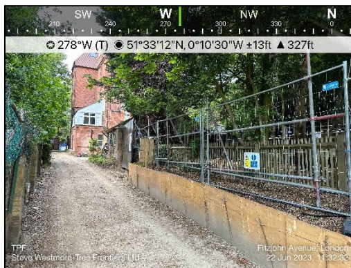
Plate 9 - TPF adjacent T13 – T19