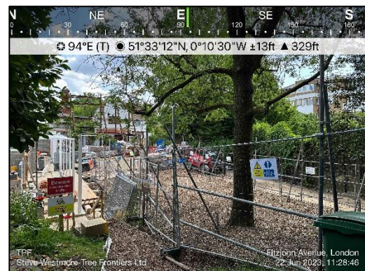
Plate 6 - TPF adjacent T10