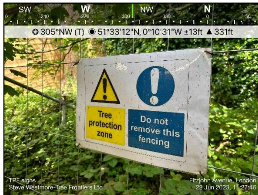
Plate 1 - TPF Signs in place