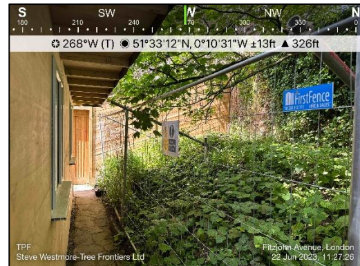
Plate 2 - TPF adjacent T2