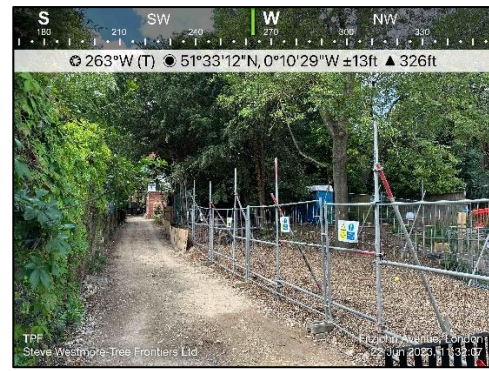
Plate 8 - TPF adjacent T10