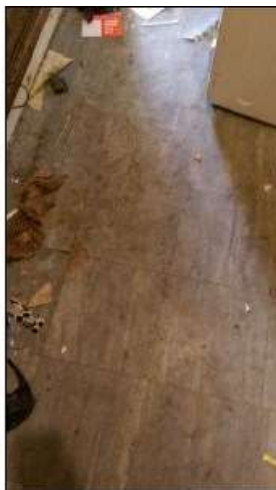
Kitchen – Thermoplastic Floor Tile

Please do not undertake work to disturb this material – contact the London Borough Camden’s Compliance Officer on 07976878836 for additional help.