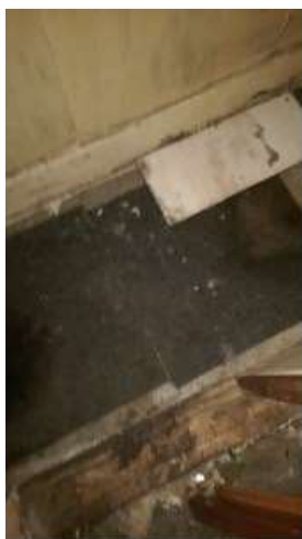
WC – Thermoplastic Floor Tile