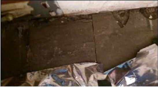
Bedroom 1 – Thermoplastic Floor tile