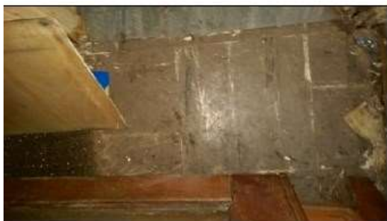
Bathroom – Thermoplastic Floor tile