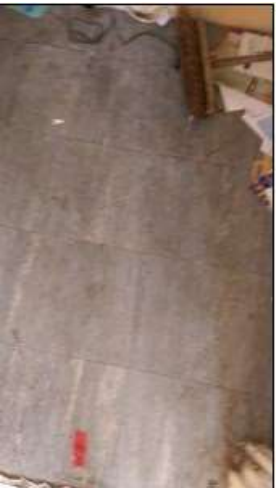
Hall – Thermoplastic Floor tile