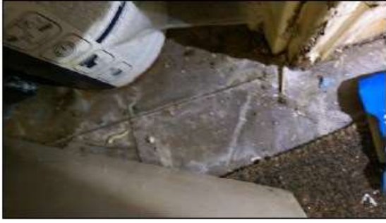
Kit Cup – Thermoplastic Floor tile