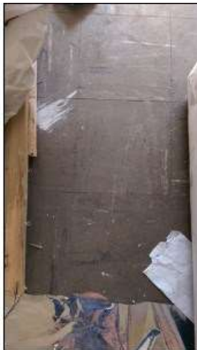
Lounge – Thermoplastic Floor tile