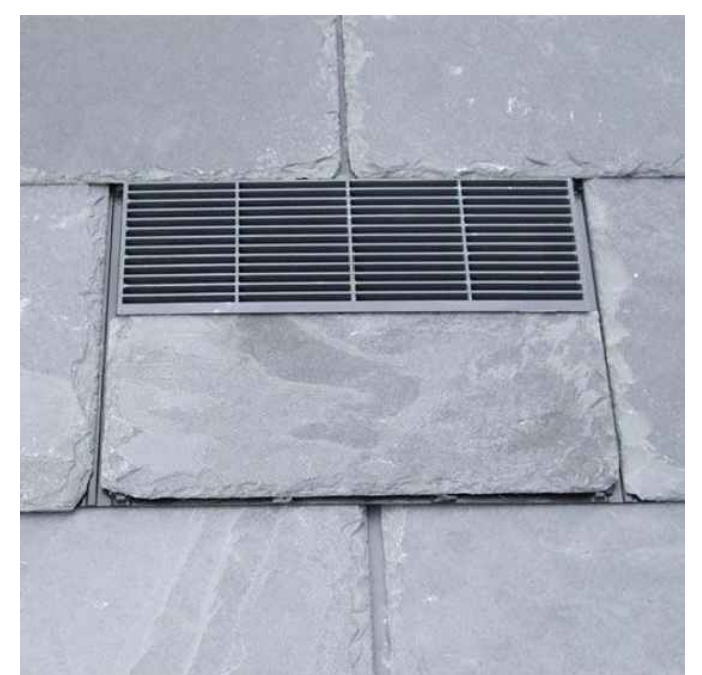
5 Roof Vent Image Image SCALE 1: na