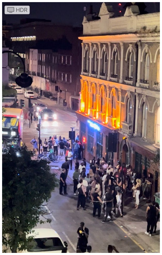
11<sup>th</sup> June 2023