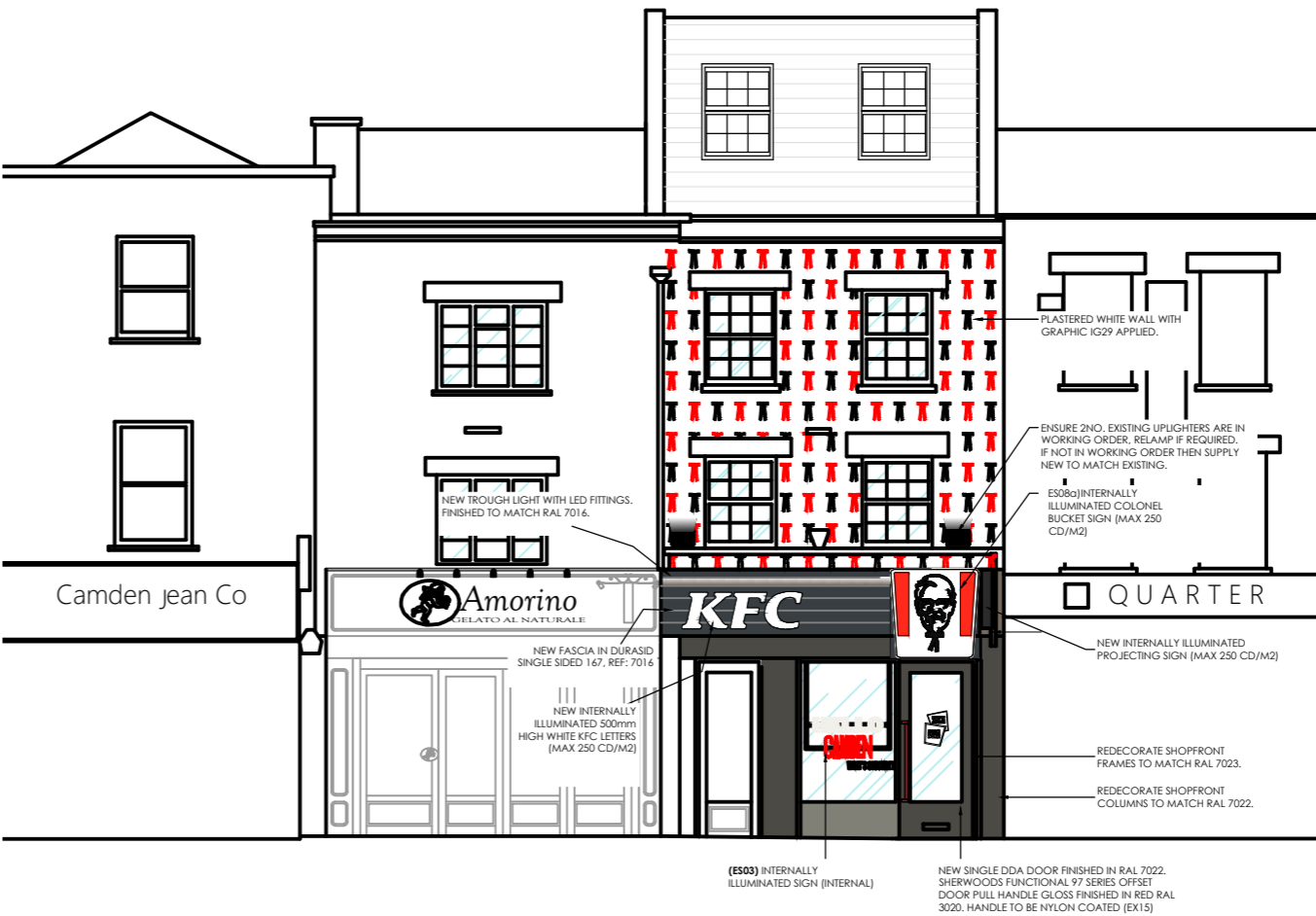
proposed front elevation