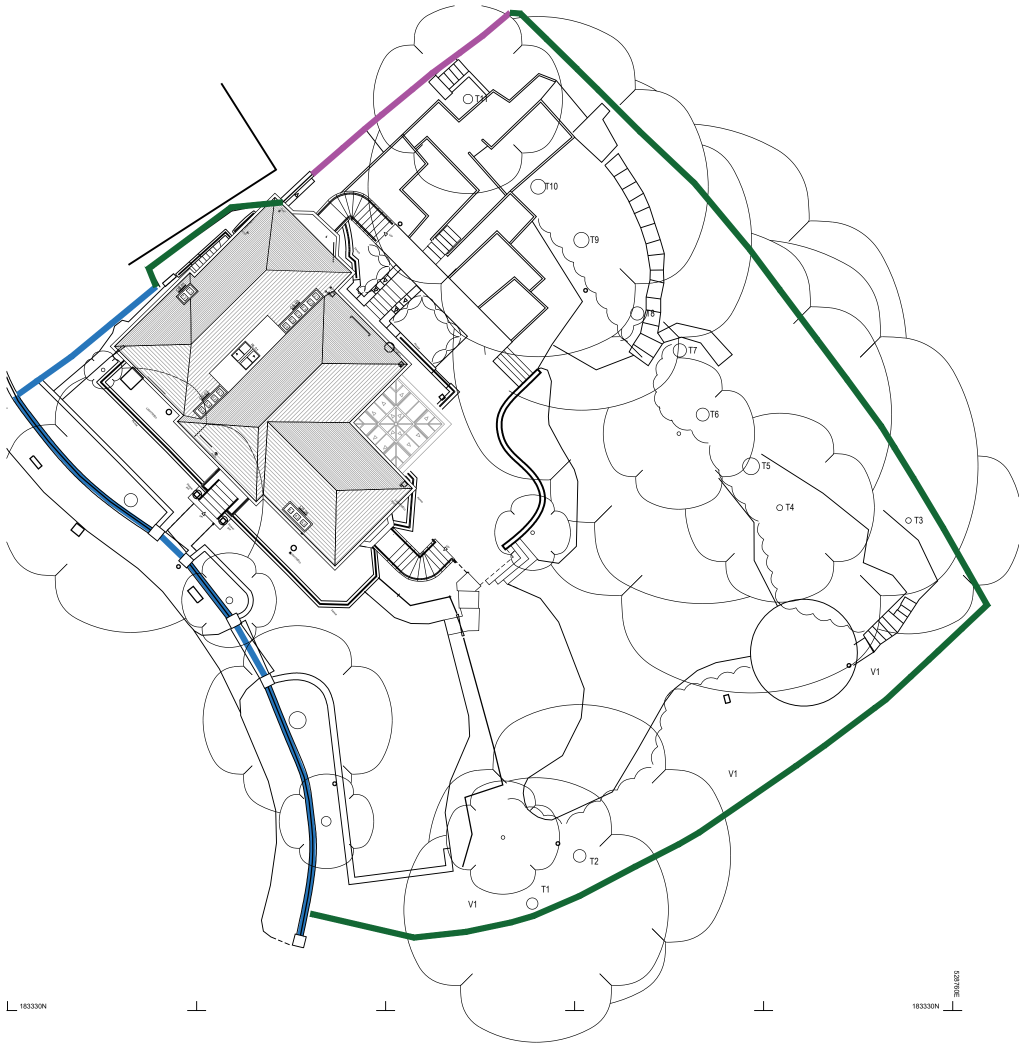
Proposed Site Plan 1:200