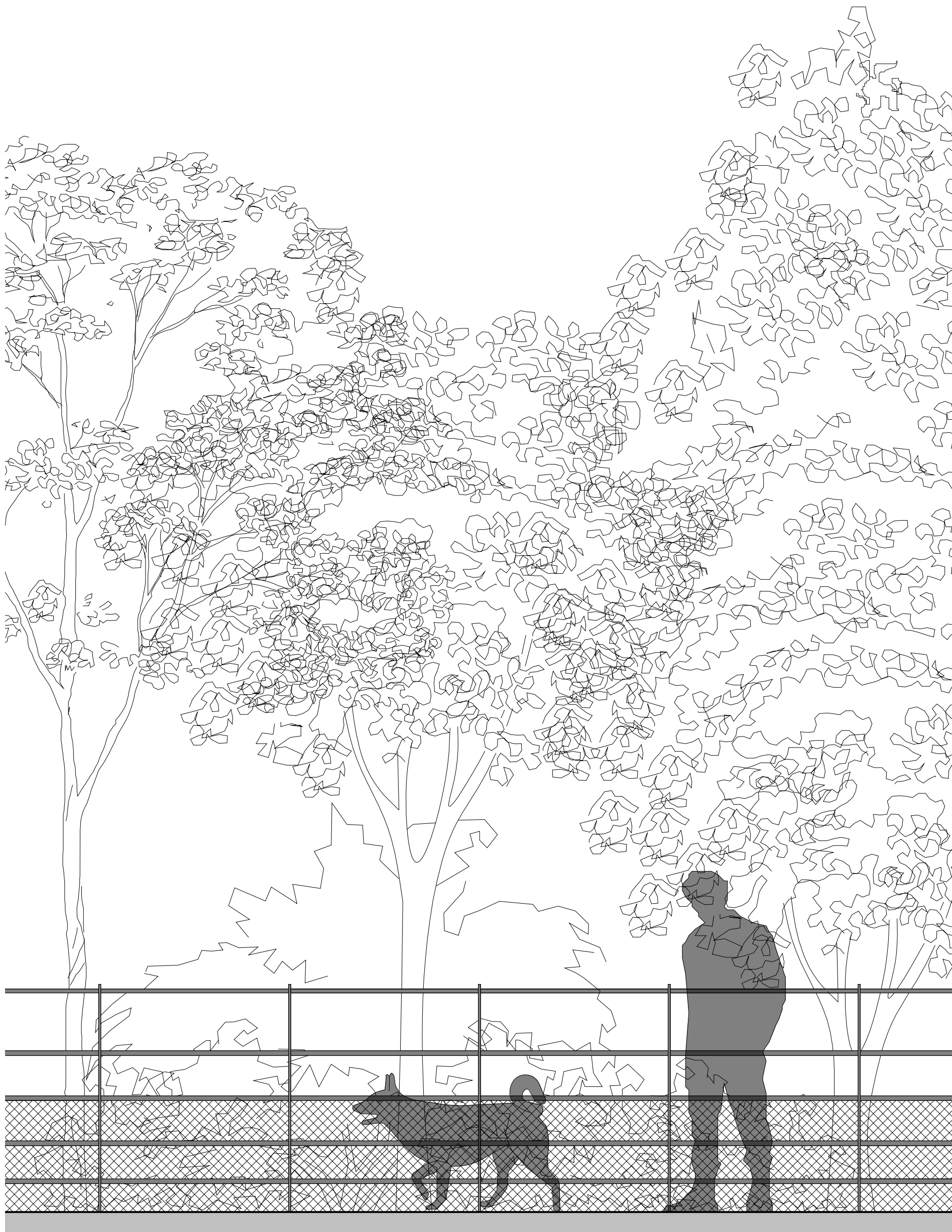
Proposed Fence Elevation 1:20