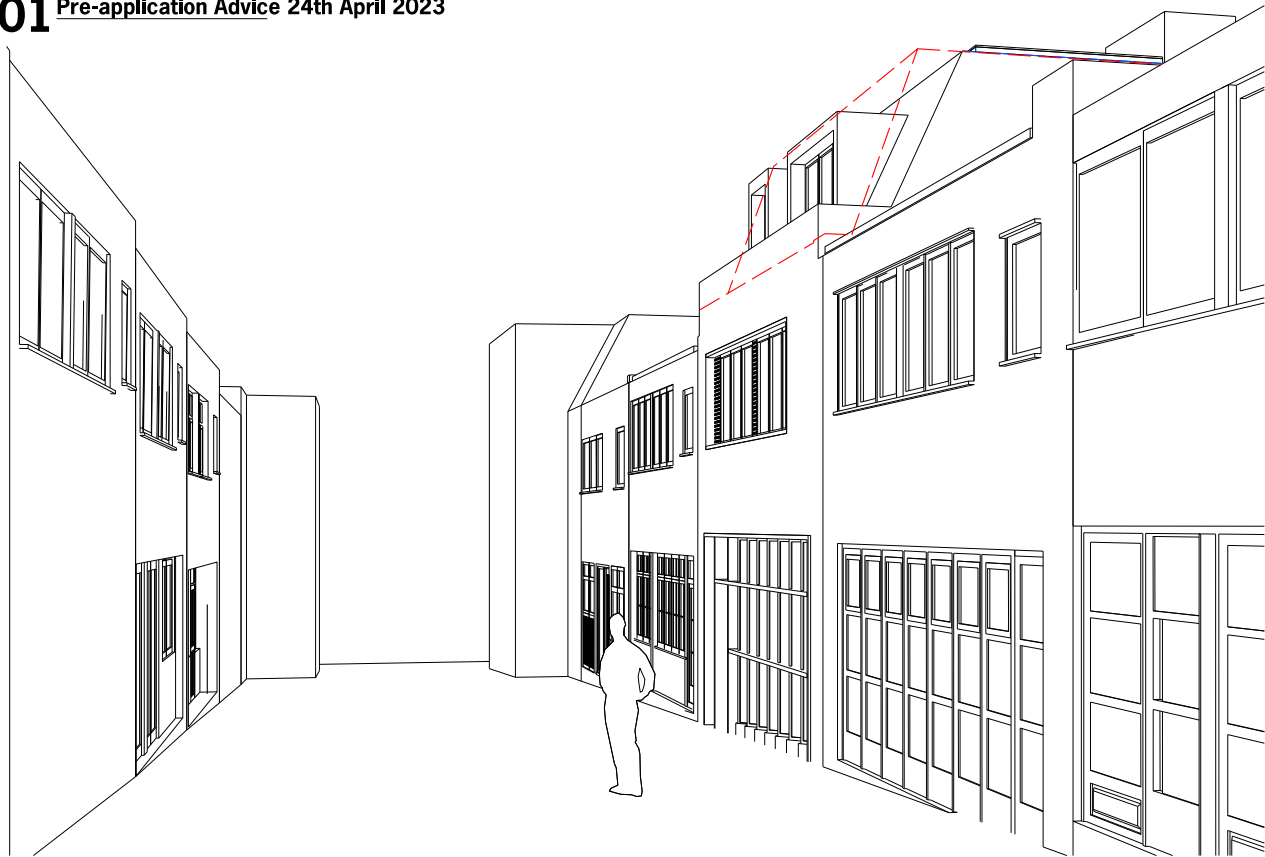
03 PLANNING SUBMISSION