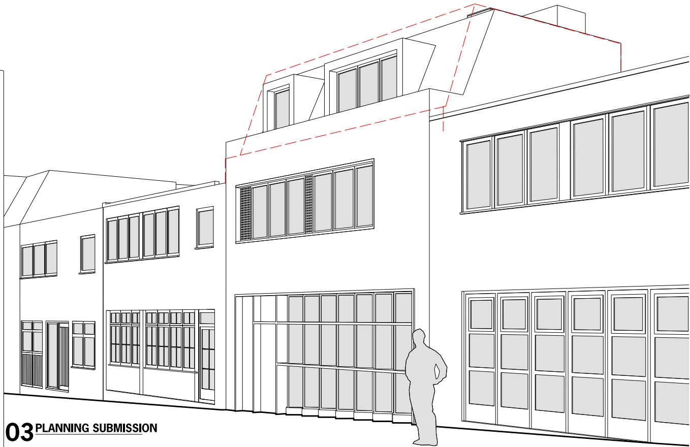
03 PLANNING SUBMISSION