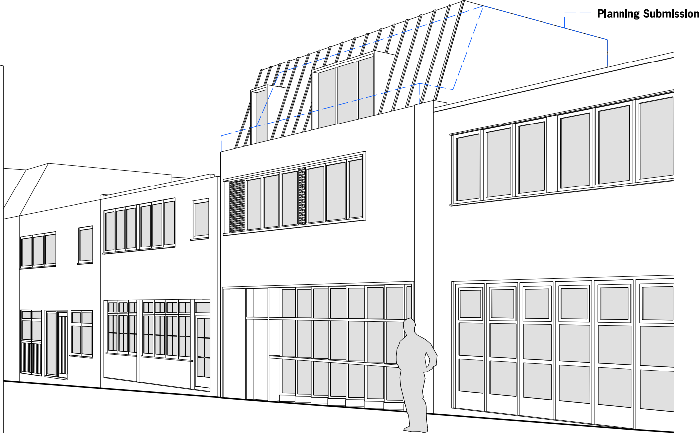
01 Pre-application Advice 24th April 2023