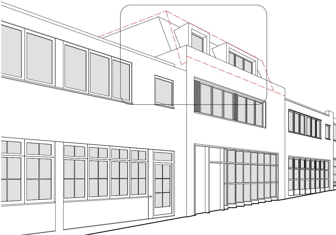
03 PLANNING SUBMISSION