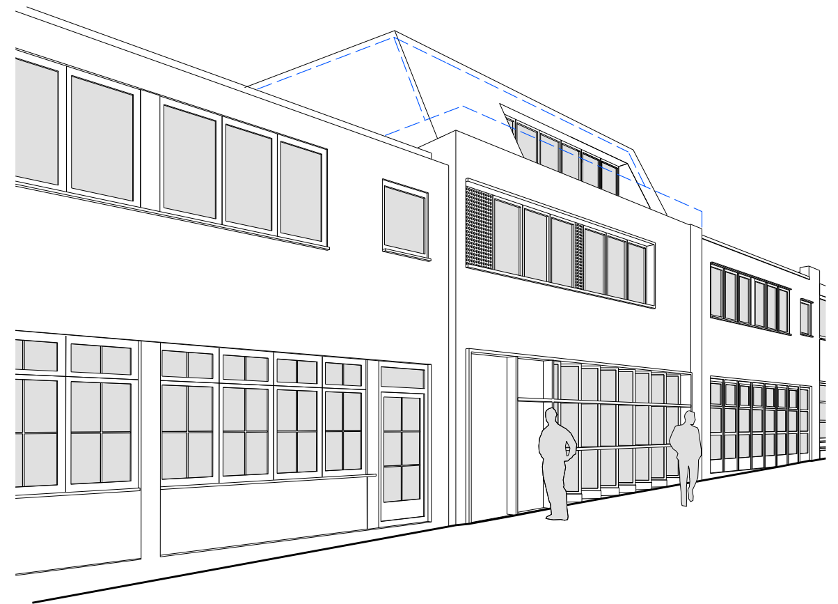
02 Pre-application Advice 11th July 2023