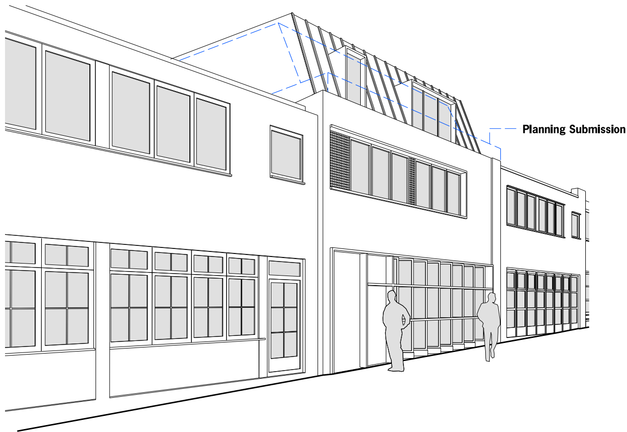
01 Pre-application Advice 24th April 2023