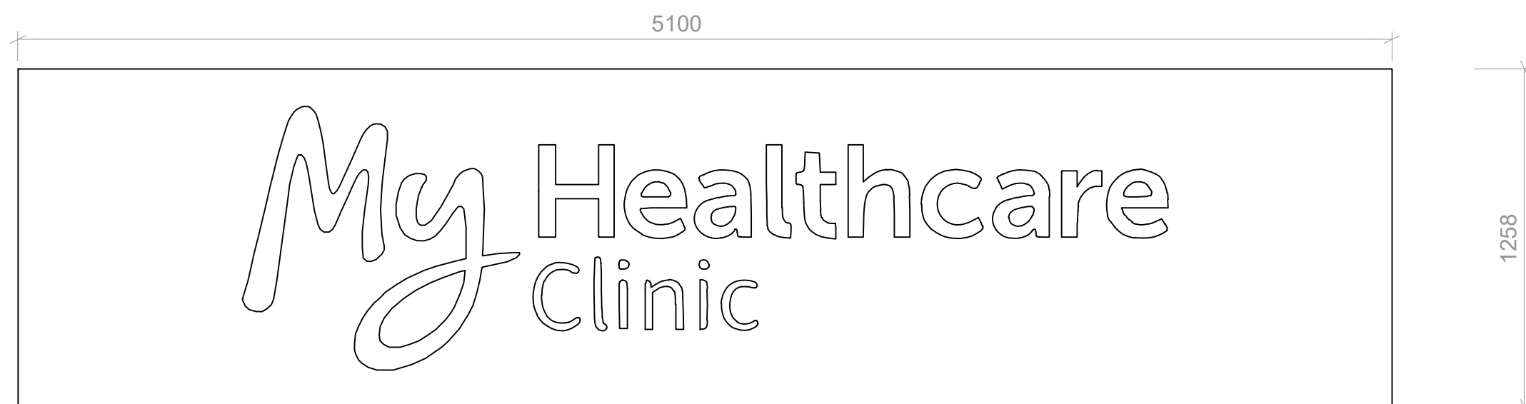
Proposed Facia Signage 1:20

Logo Green C: 70 M: 0 Y: 80 K: 0 R: 77 G: 176 B: 91 #4cb05b