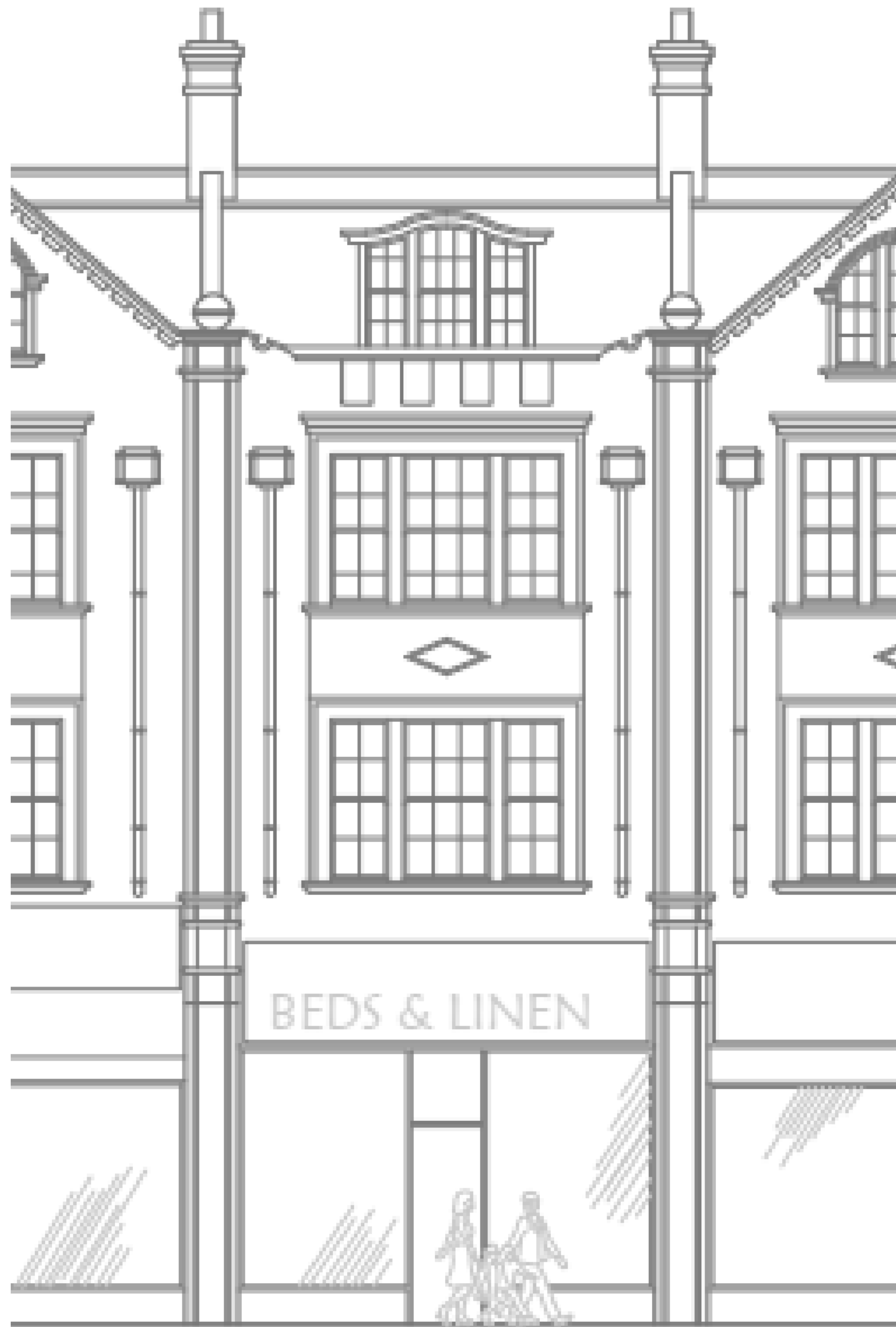
Existing Front Elevation 1:50