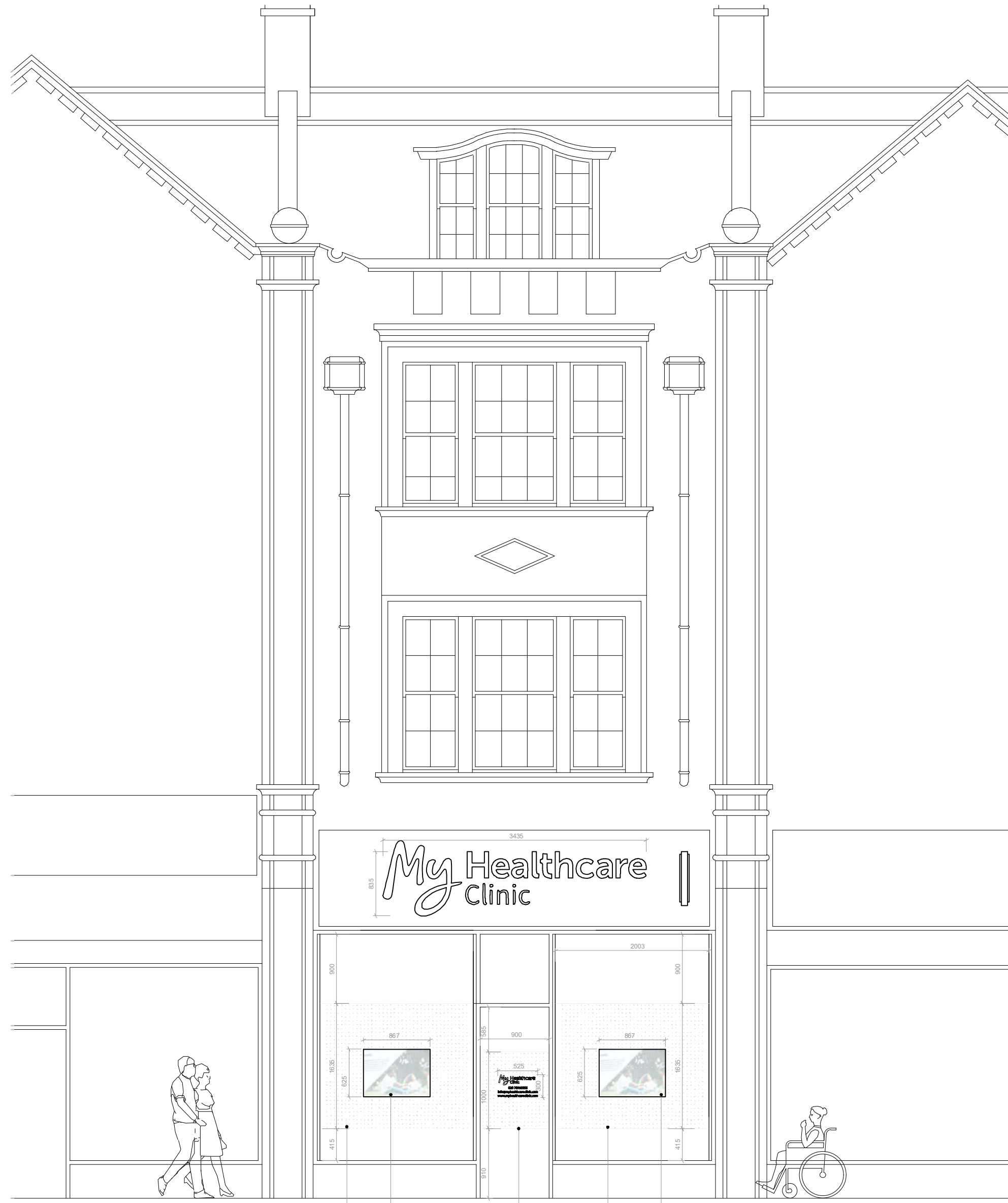
Proposed Front Elevation 1:50