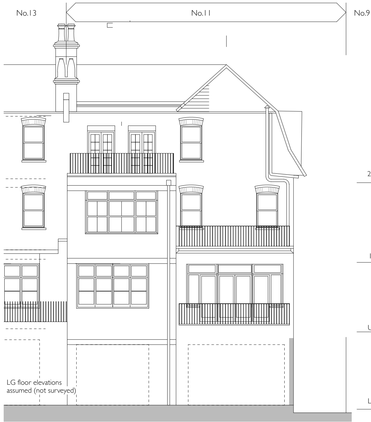
1 Existing West Elevation 1:100

All subject to detailed design and statutory consents.