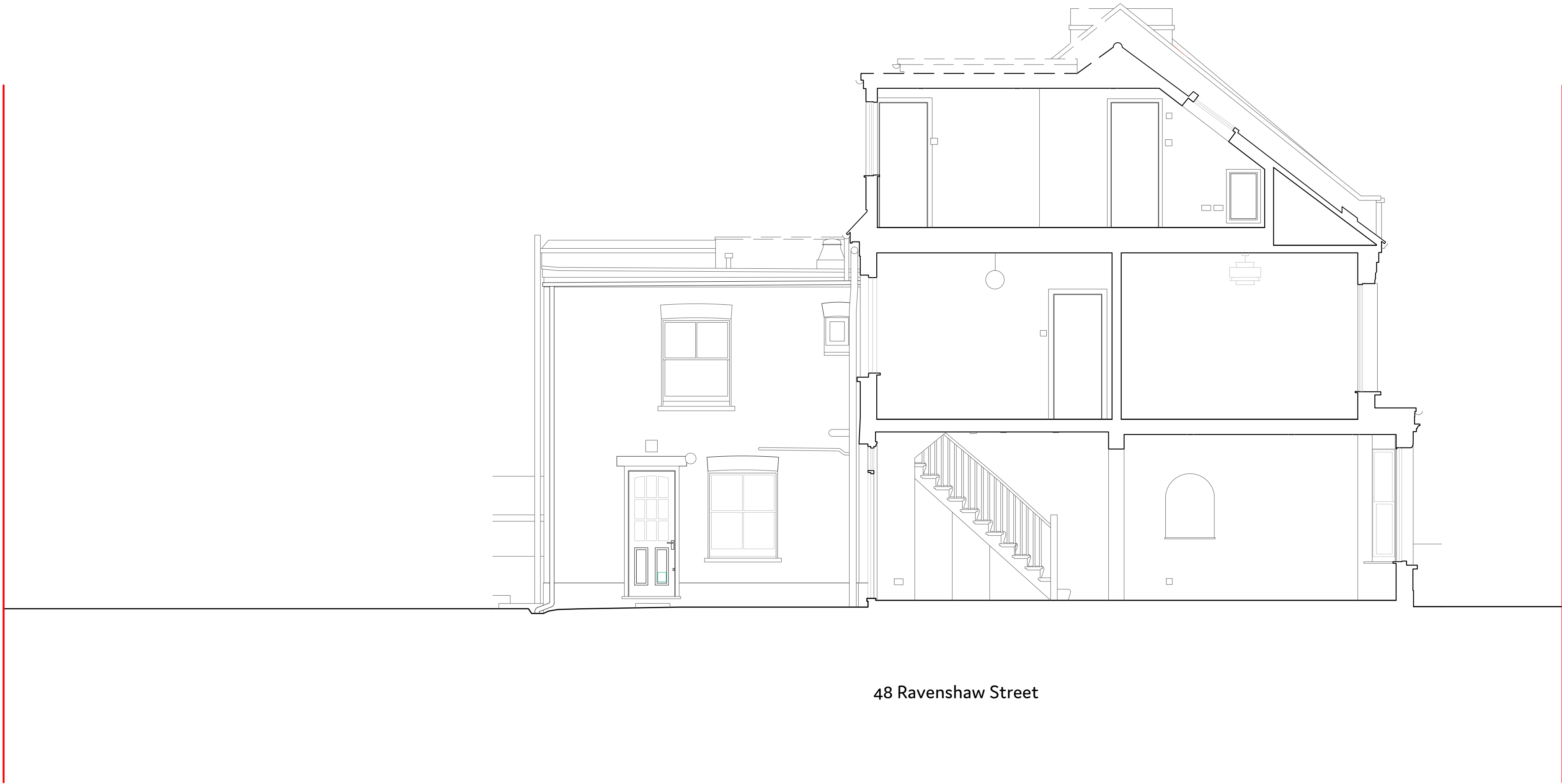
48 Ravenshaw Street