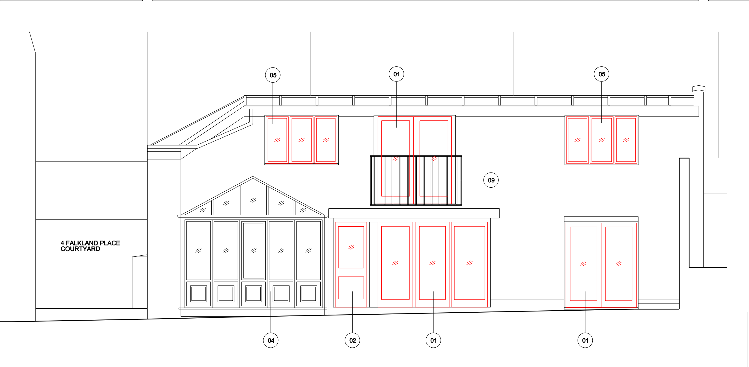
01 Existing Front Elevation