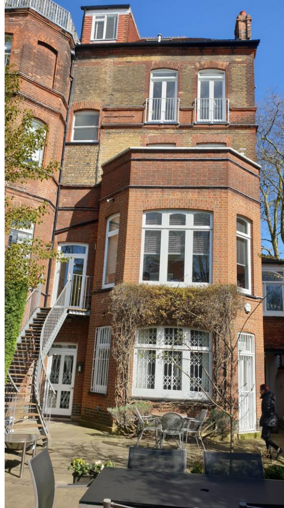
Existing rear façade

Reason: To safeguard the appearance of the premises and the character of the immediate area in accordance with the requirements of policies D1 and D2 of the London Borough of Camden Local Plan 2017.