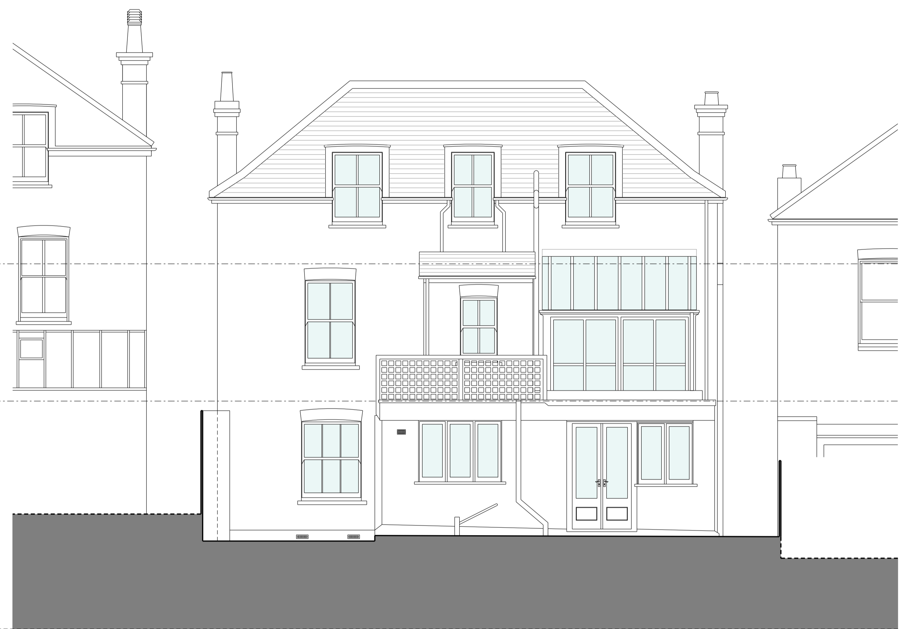
01 EXISTING REAR ELEVATION SCALE 1:100 @A3