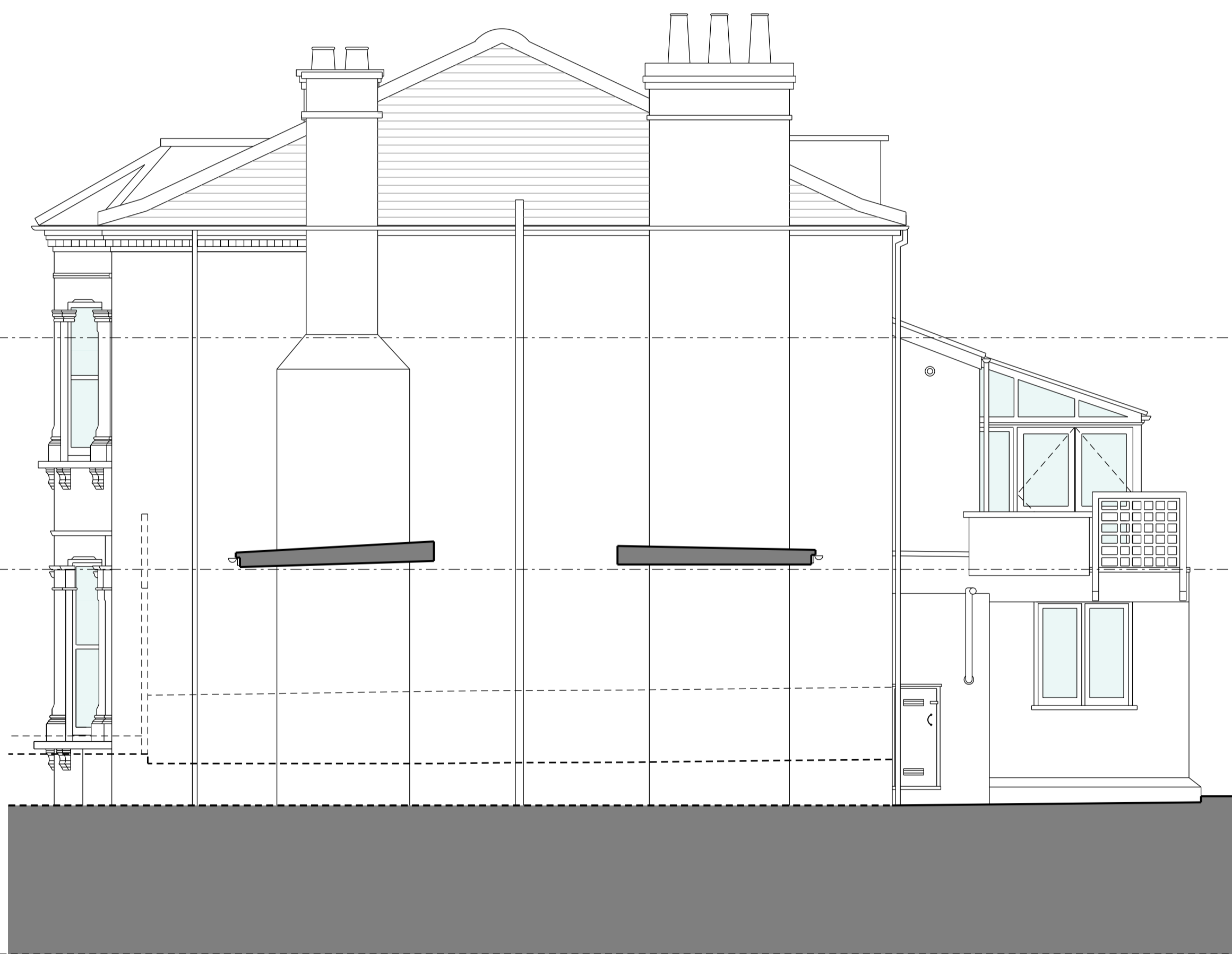
01 EXISTING EAST ELEVATION SCALE 1:100 @A3