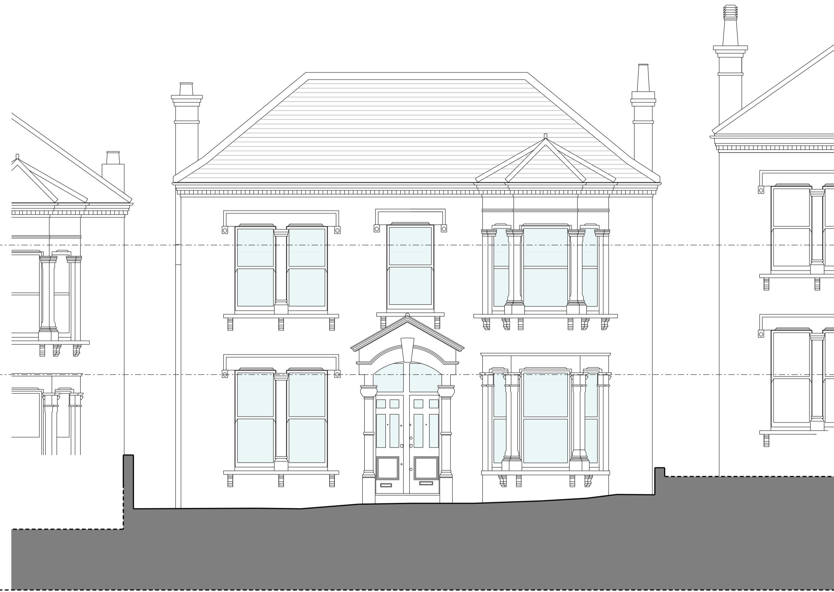
01 EXISTING FRONT ELEVATION SCALE 1:100 @A3