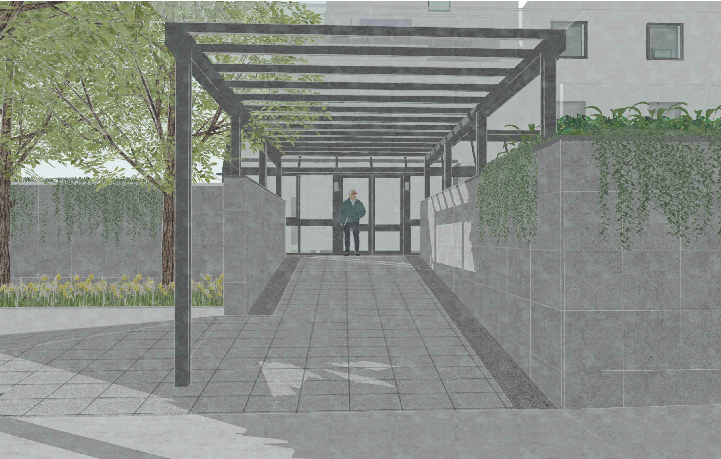
2. Proposed ramp up to main entrance, from Boundary Road