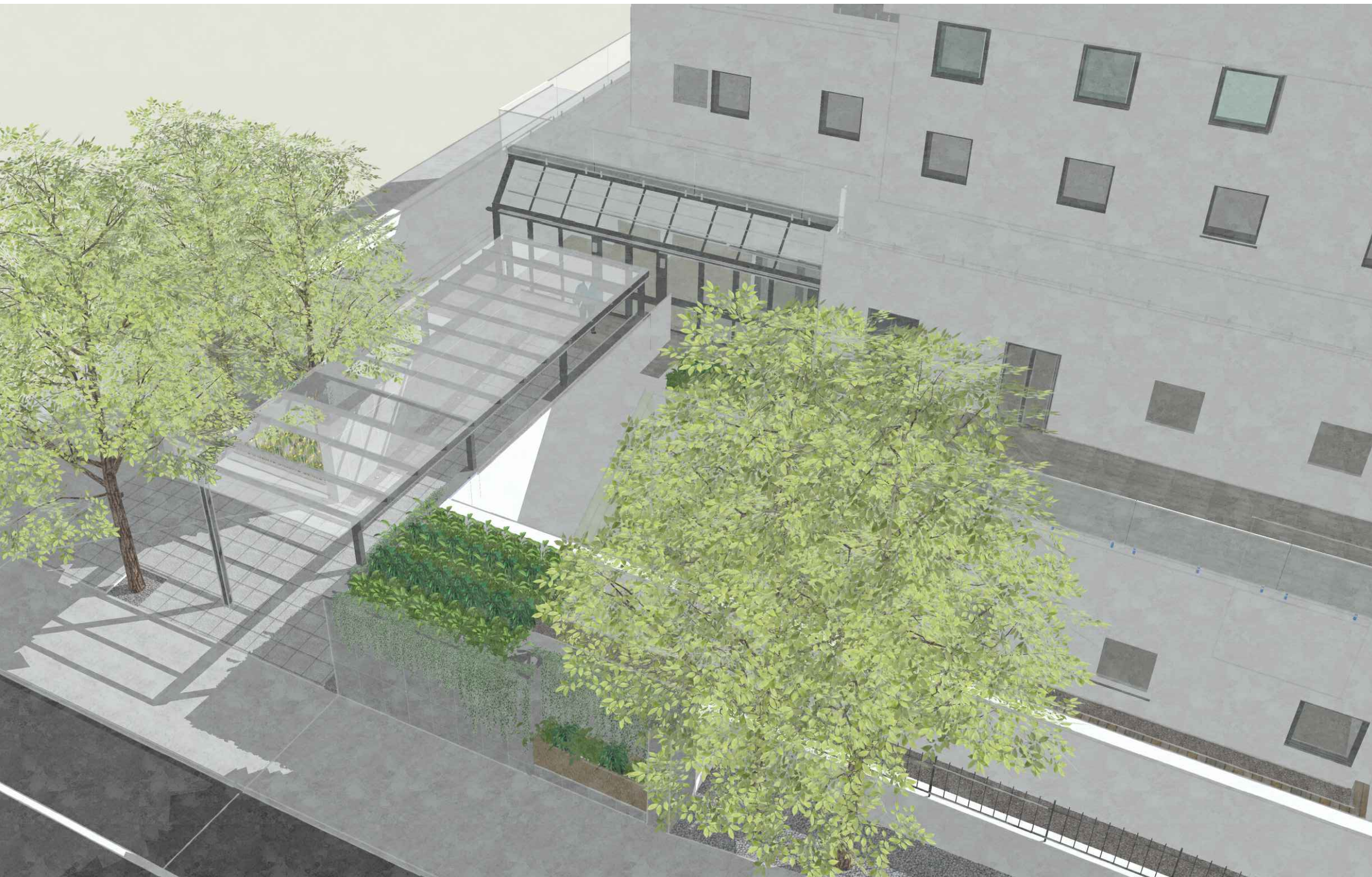
4. Proposed overhead view of entrance point and canopy, Boundary Road

Do not scale, use figured dimensions only.