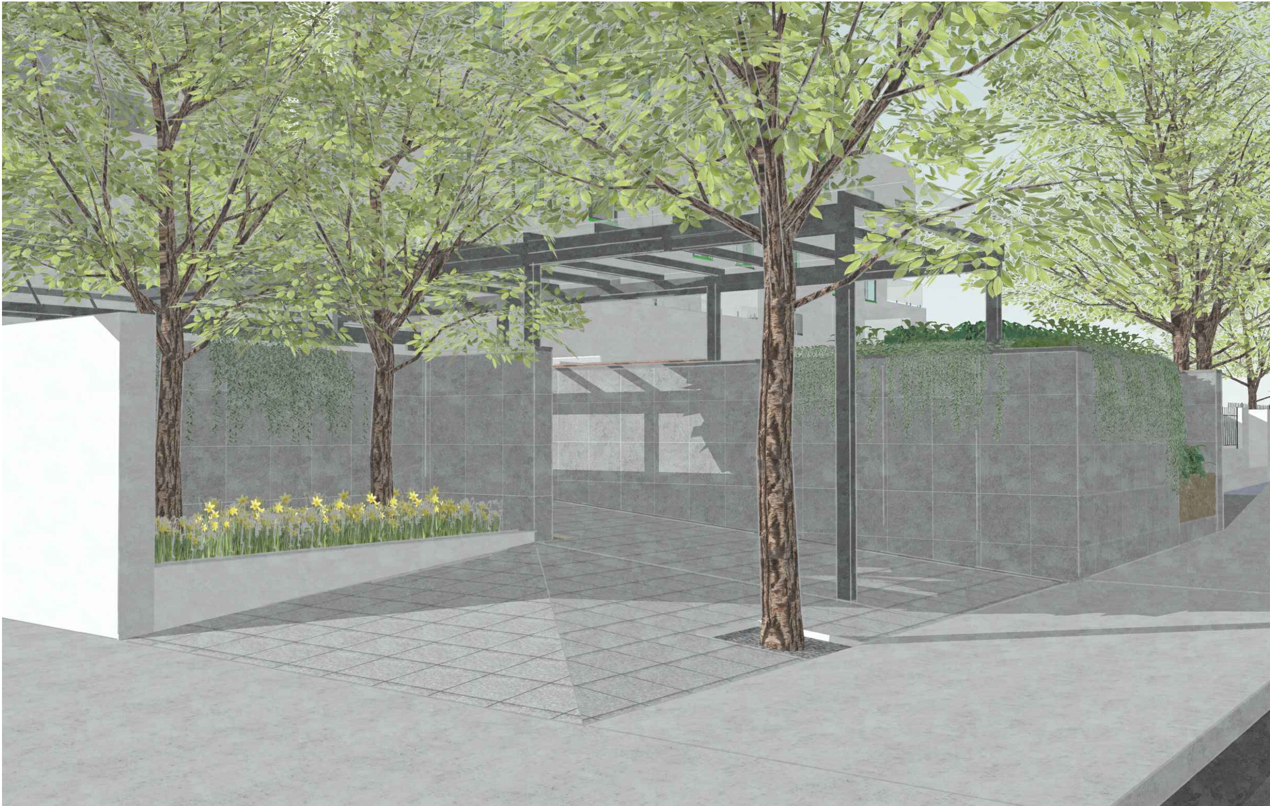
1. Proposed front entrance approach from Boundary Road