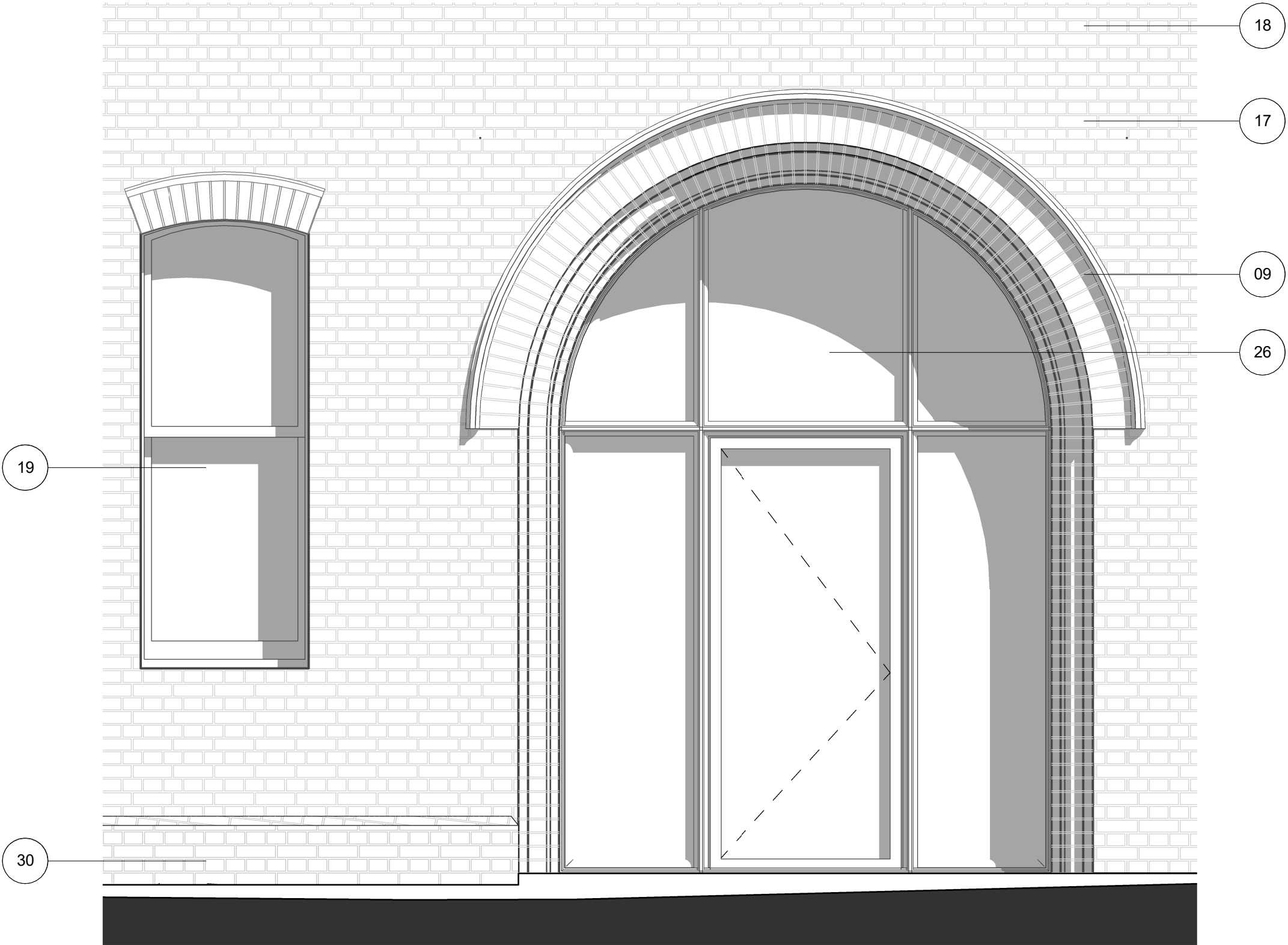
1 Planning - Proposed - R7 North Facade Scale: 1 : 25