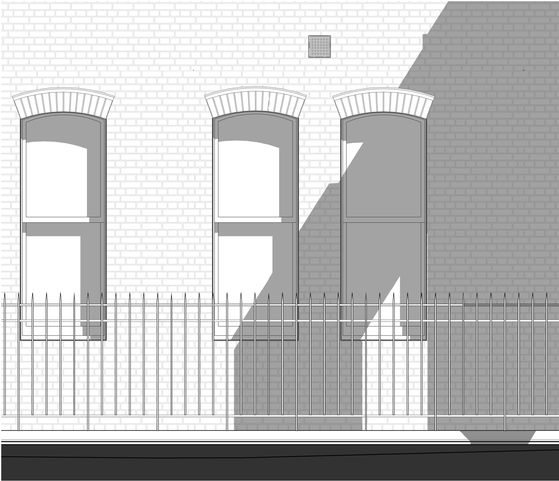
2 Planning - Existing - R7 North Facade Scale: 1 : 25