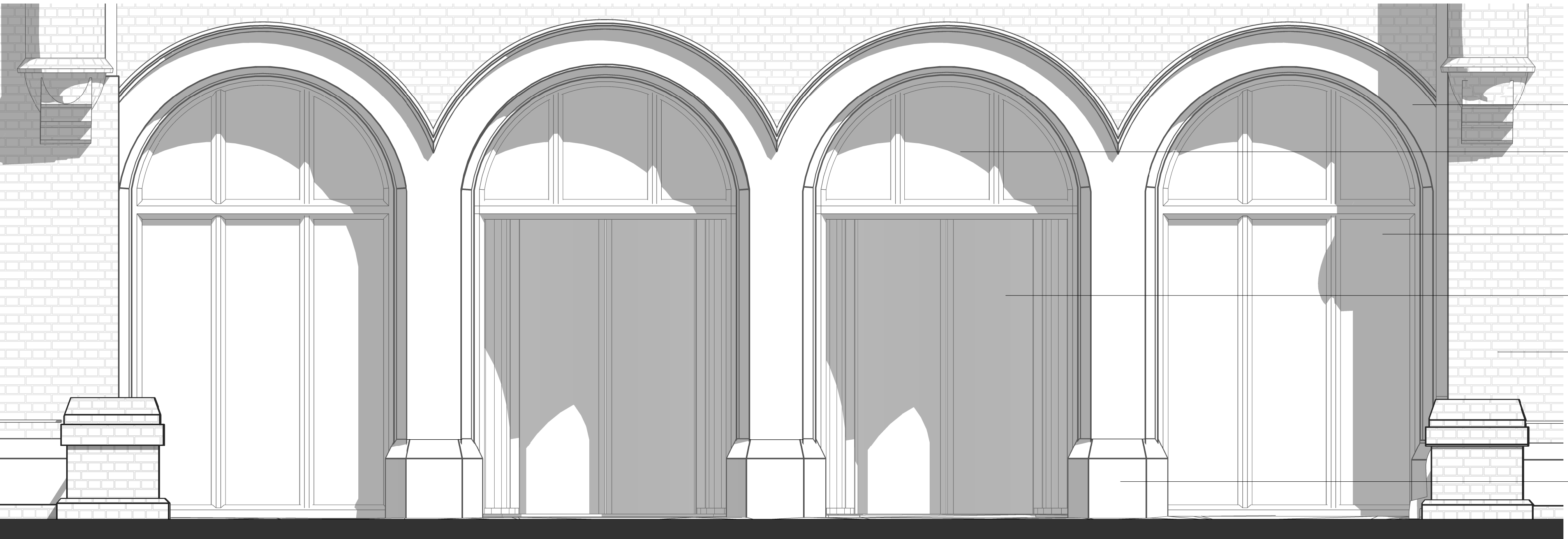
2 Planning - Proposed - R6 South Facade Scale: 1 : 25