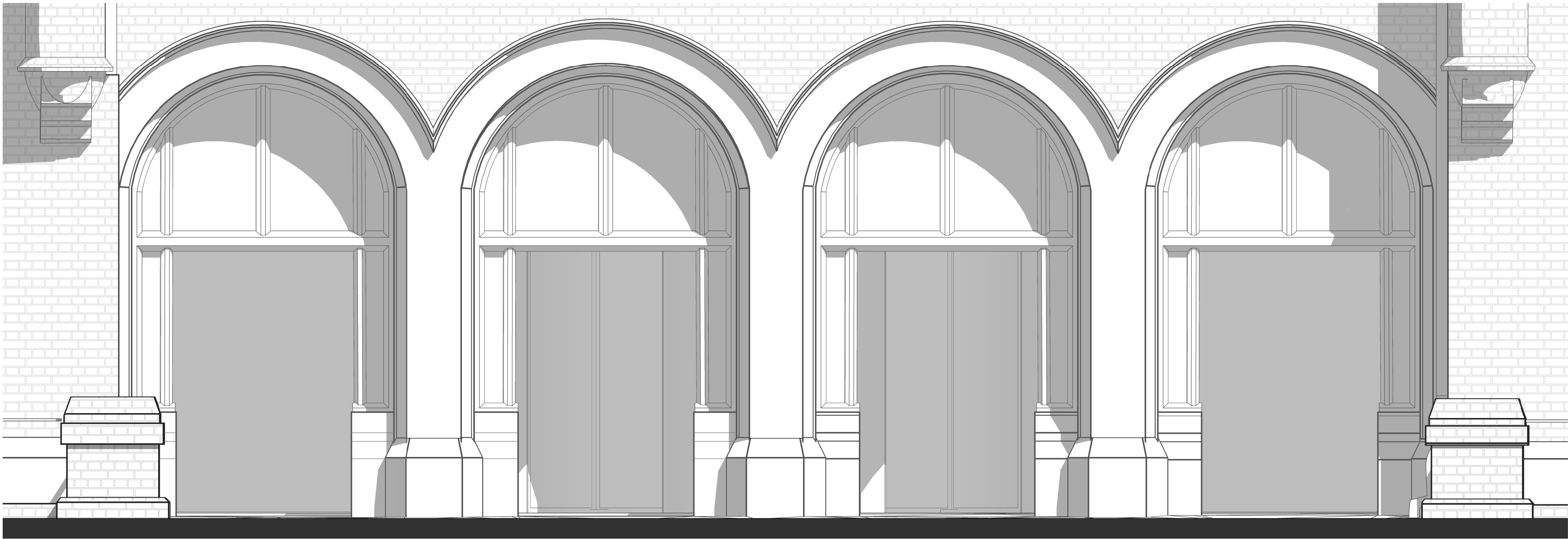
1 Planning - Existing - R6 South Facade Scale: 1 : 25