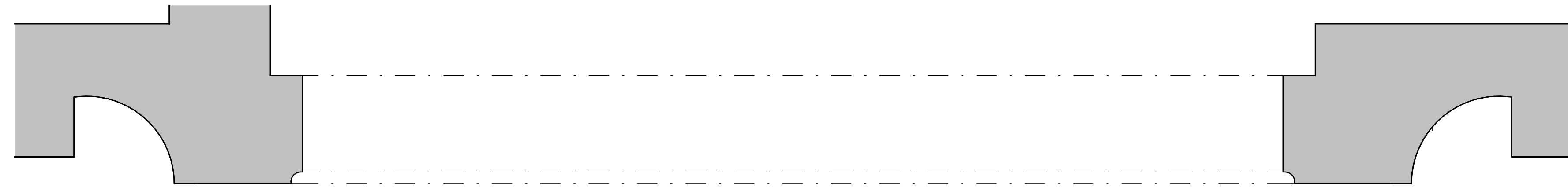
3 00 - Proposed - Planning - Bay Study 16 - Ground Floor Plan Scale: 1 : 25