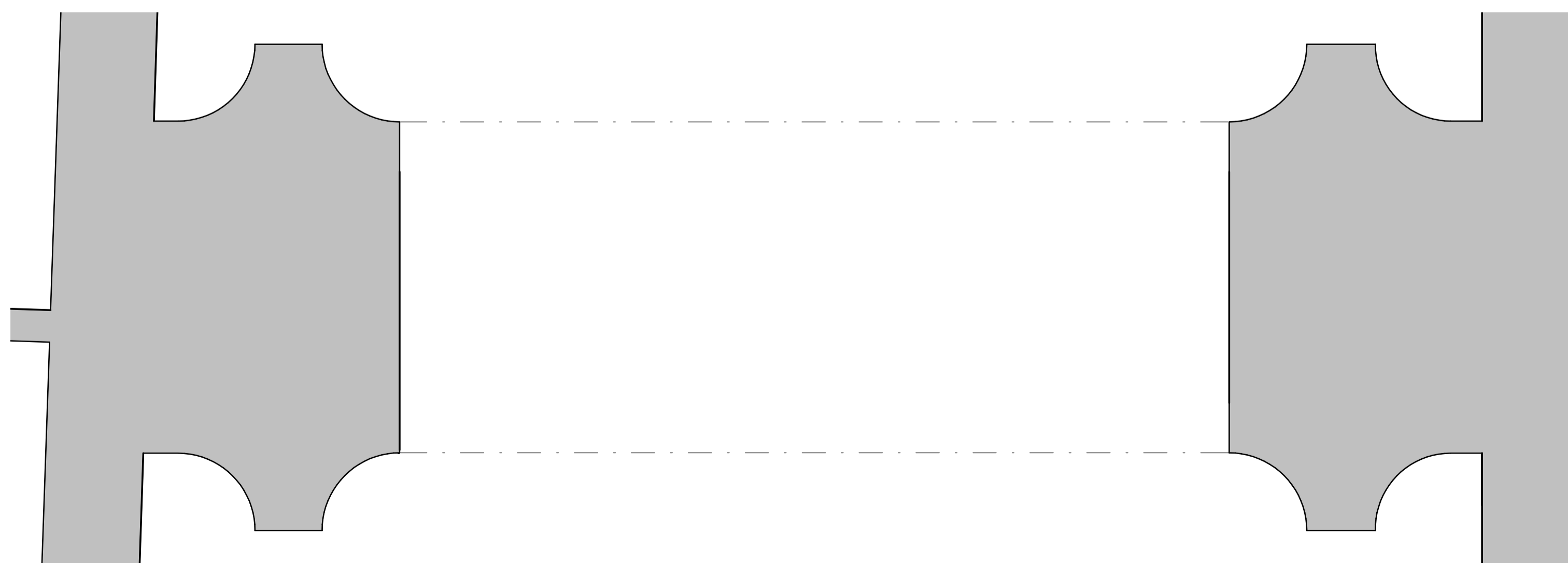
3 00 - Proposed - Planning - Bay Study 10 - Ground Floor Plan Scale: 1 : 25