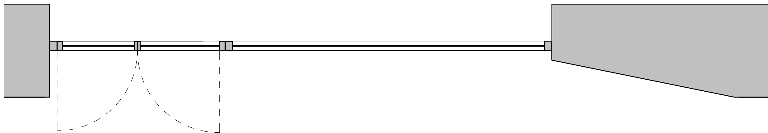
3 00 - Proposed - Planning - Bay Study 04 - Ground Floor Plan Scale: 1 : 25