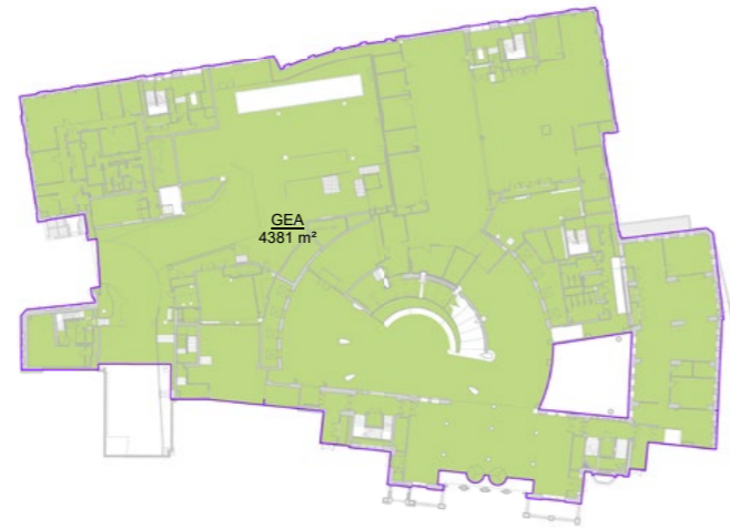
1 00 - FFL PR Scale: 1 : 500