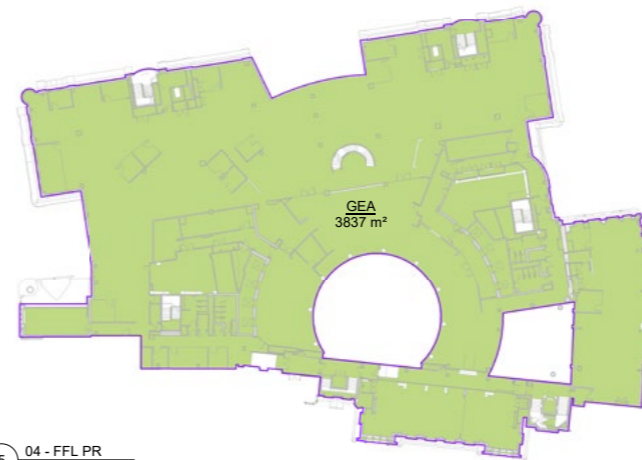
5 04 - FFL PR Scale: 1 : 500