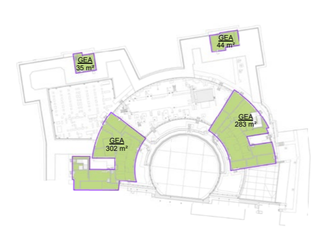
7 06 - FFL PR Scale: 1 : 500