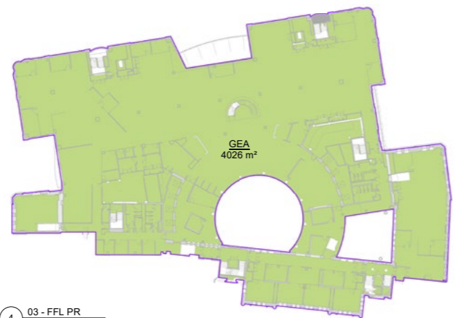
4 03 - FFL PR Scale: 1 : 500