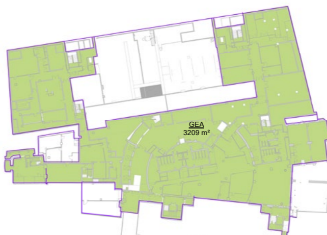
8 LG - FFL PR Scale: 1 : 500