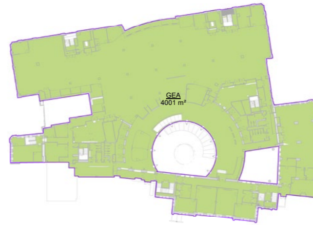
2 01 - FFL PR Scale: 1 : 500