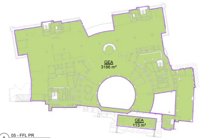
6 05 - FFL PR Scale: 1 : 500