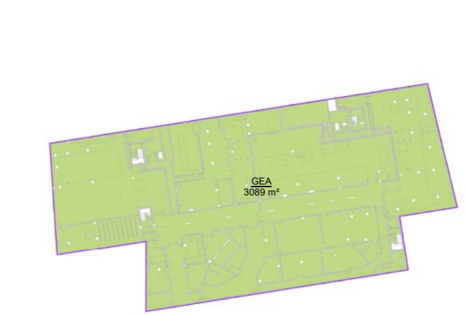
9 B1 - FFL PR Scale: 1 : 500