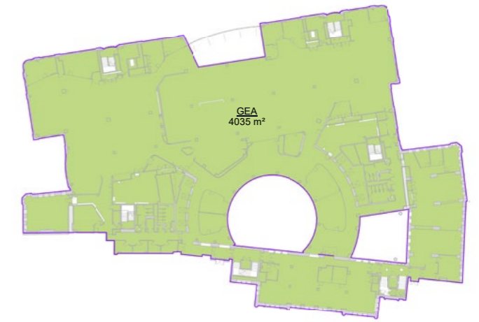
3 02 - FFL PR Scale: 1 : 500