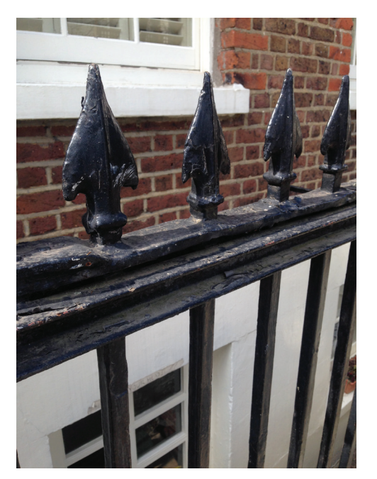
Photographs of existing Railings at No. 4 Holly Mount.