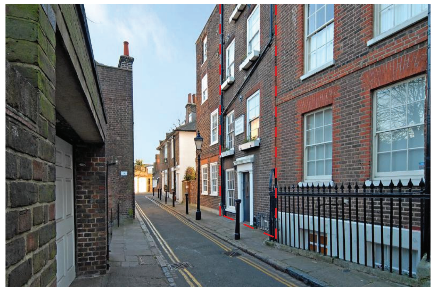
Photograph of Holly Mount, No. 4 indicated in red.