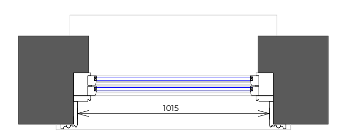
Horizontal Section through sash