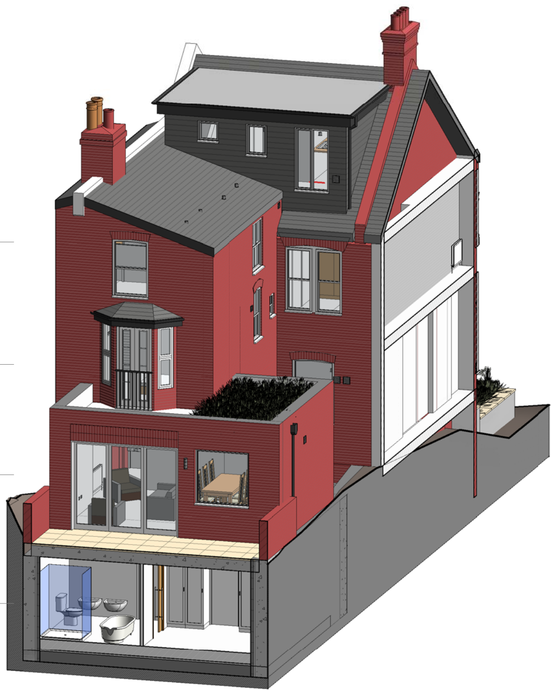
6. 3D - Proposed - Rear