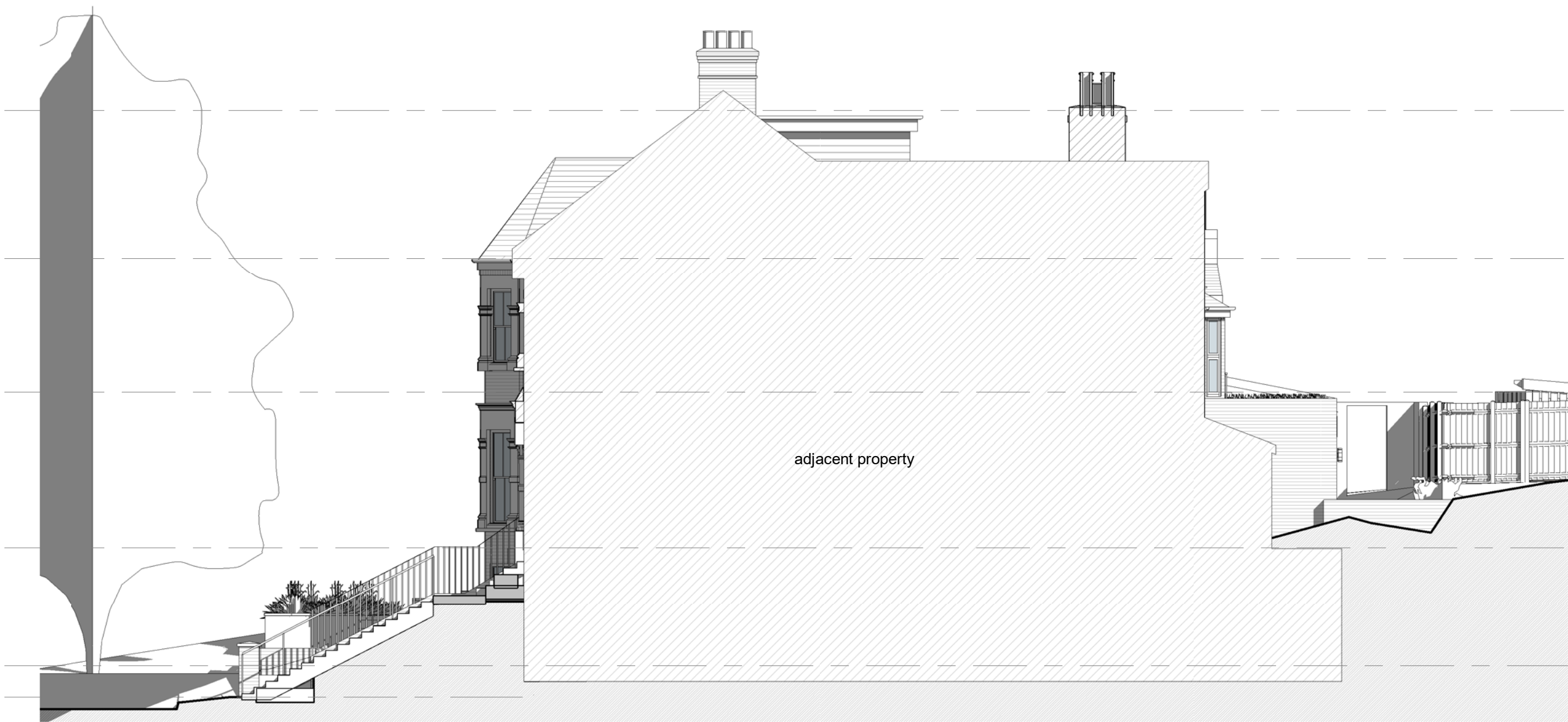
4. Right Side - Proposed 1 : 100