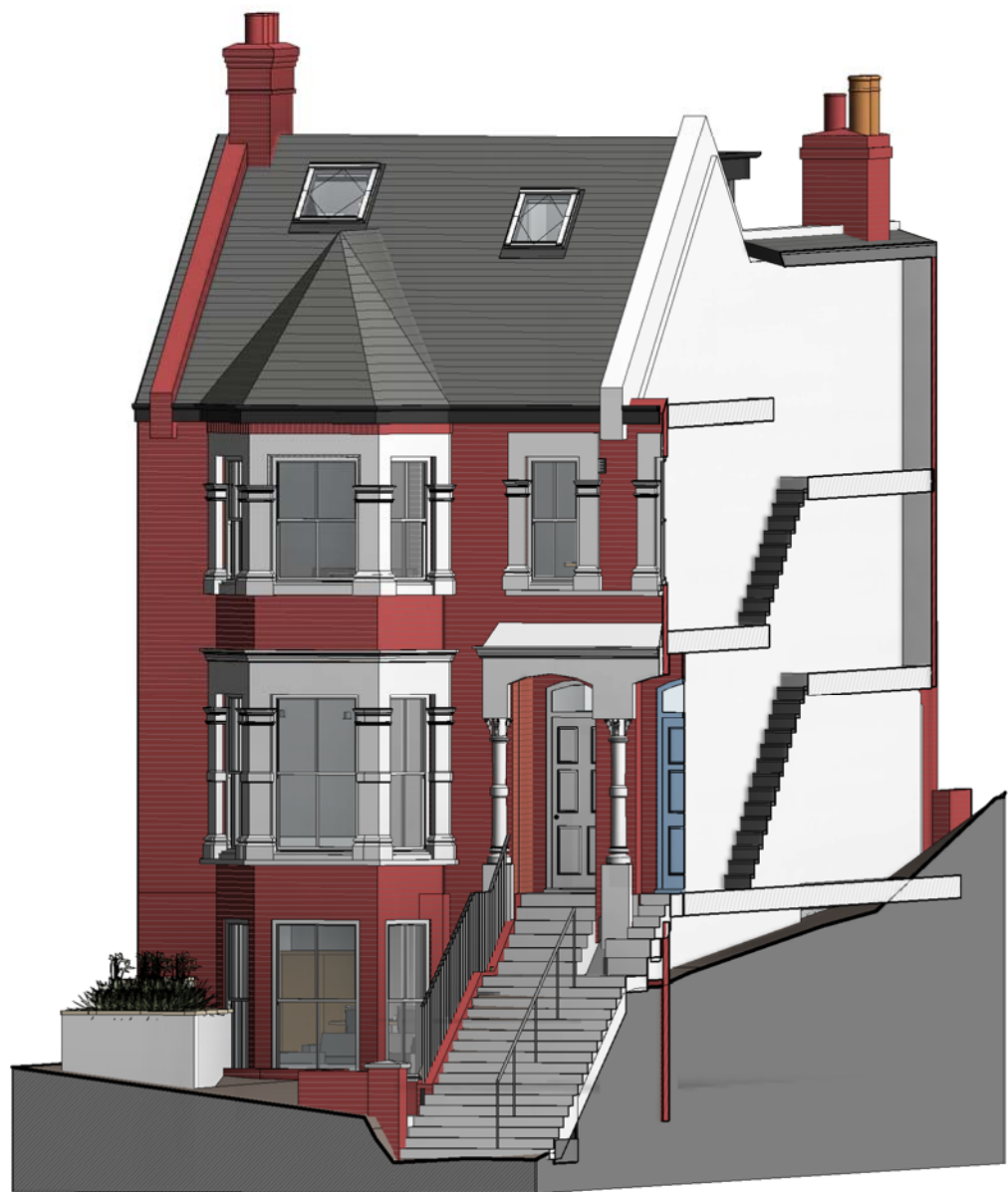
5. 3D - Proposed - Front