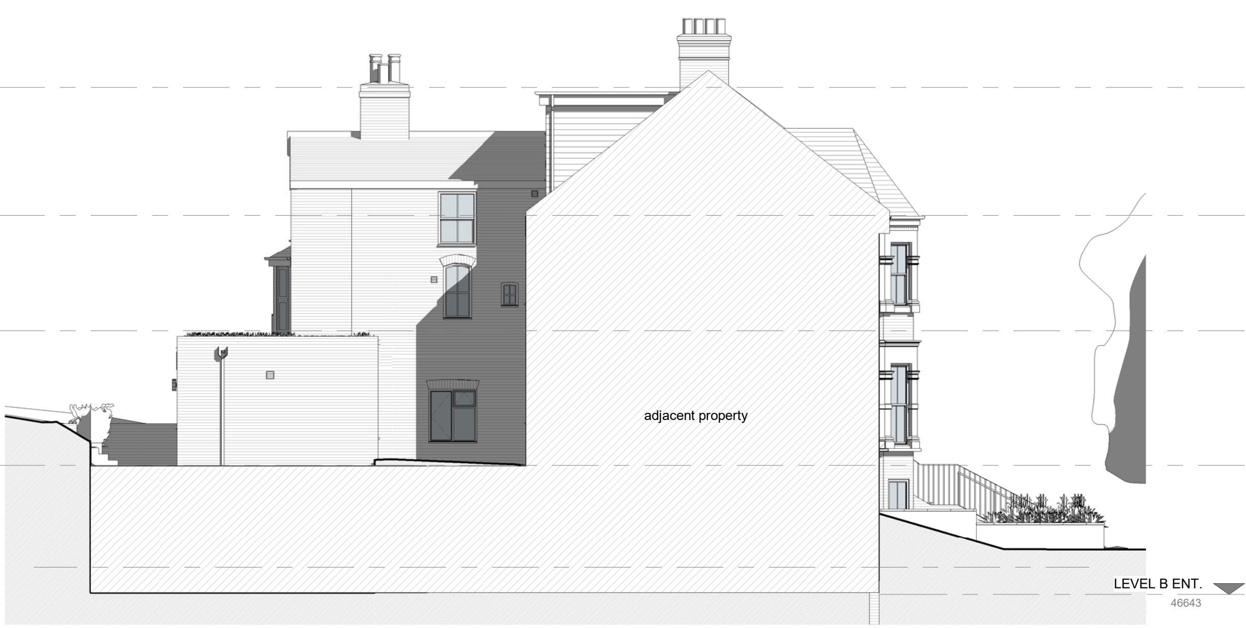
2. Left Side - Proposed 1 : 100