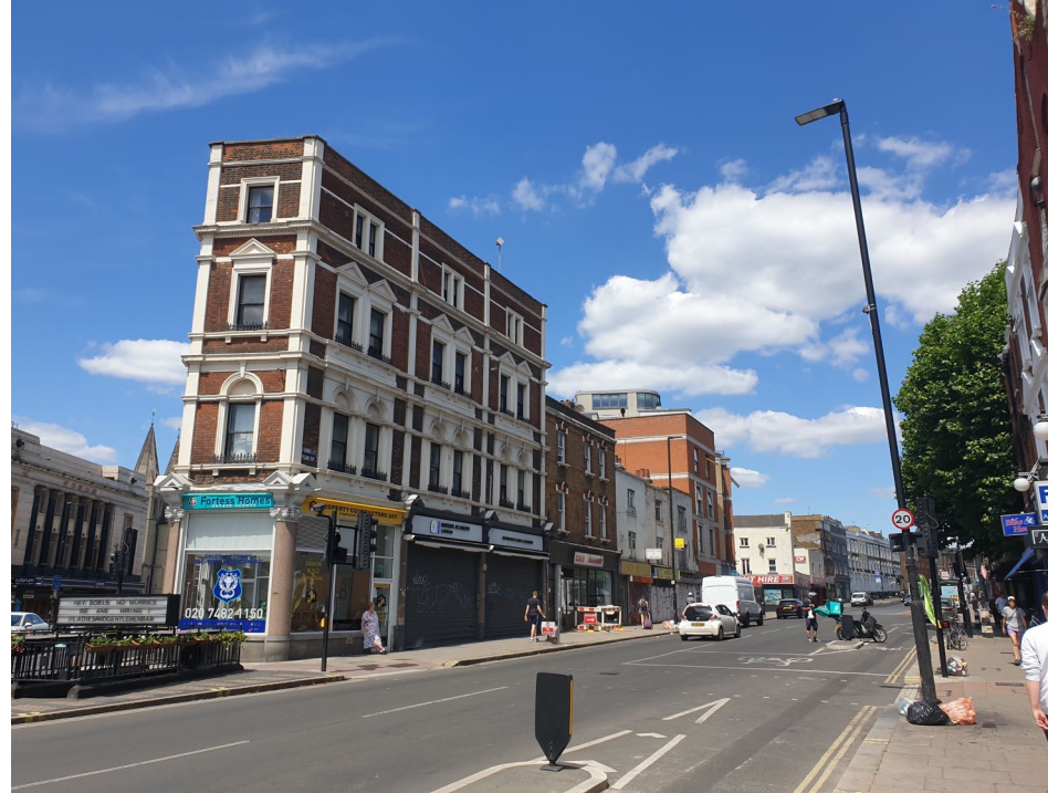
PH2 - SIDE VIEW OF NUMBERS 2, 1, 1a, 3, 5, 7 & 9