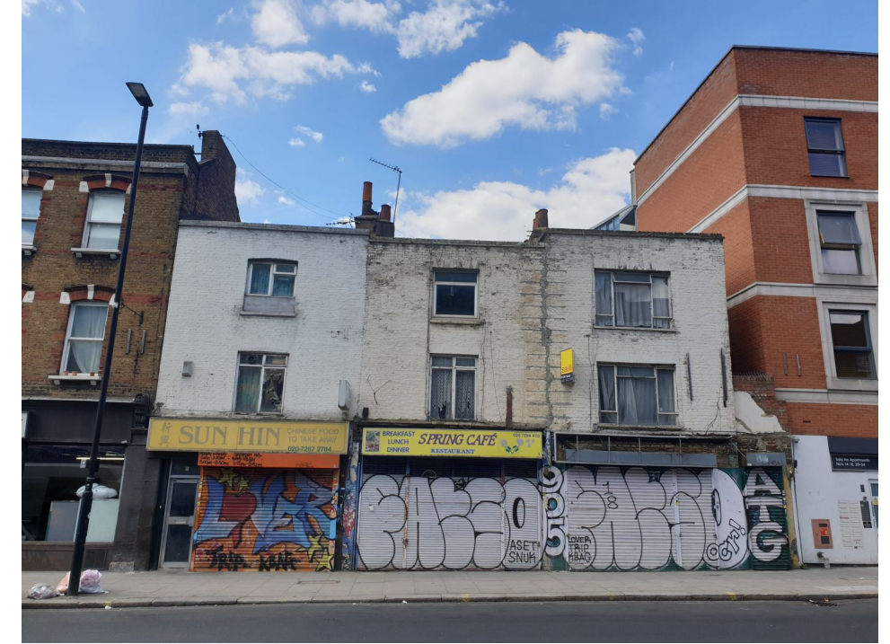
PH3 - FRONT VIEW OF NUMBERS 7, 5 & 3