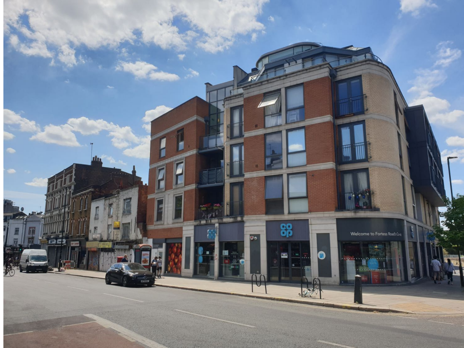
PH1 - SIDE VIEW OF NUMBERS 9, 7, 5, 3, 1, 1a & 2