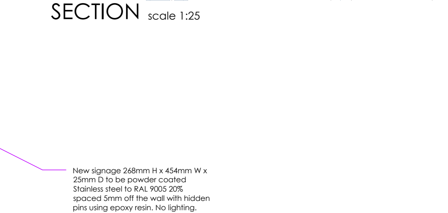
New signage 268mm H x 454mm W x 25mm D to be powder coated Stainless steel to RAL 9005 20% spaced 5mm off the wall with hidden pins using epoxy resin. No lighting.

THIS DRAWING REMAINS THE PROPERTY OF BASE INTERIORS LTD. IT MAY NOT BE COPIED OR REPRODUCED WITHOUT EXPRESS WRITTEN CONSENT. FIGURED DIMENSIONS SHOULD BE USED WHERE GIVEN. DO NOT SCALE.