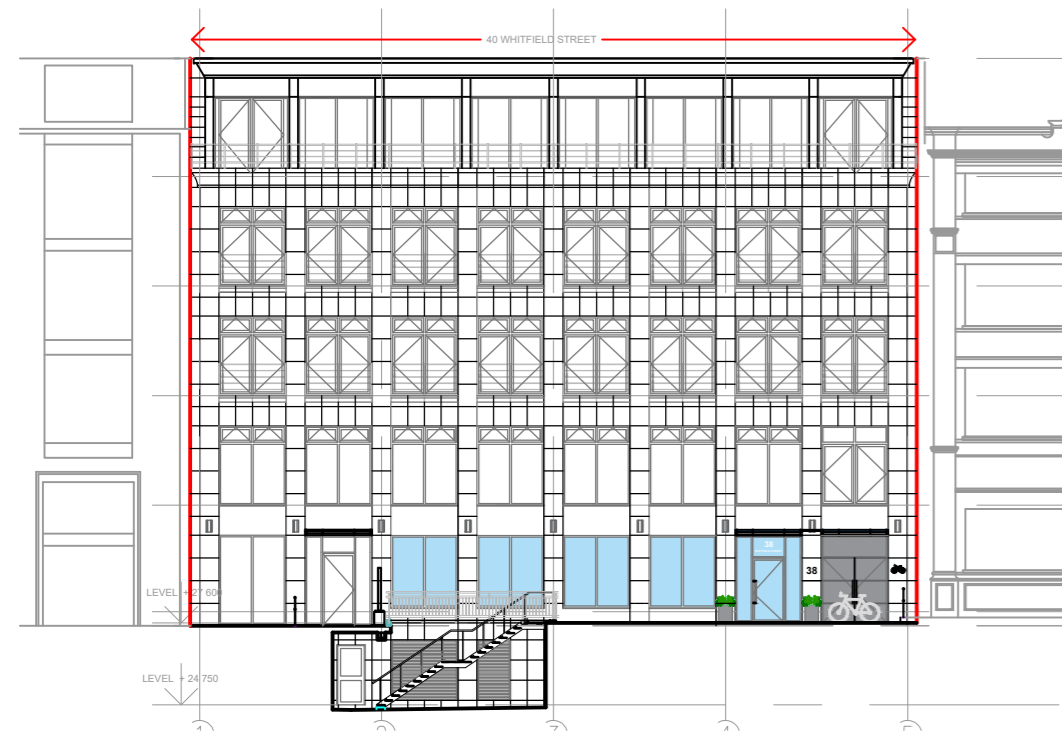
ELEVATION scale 1:250