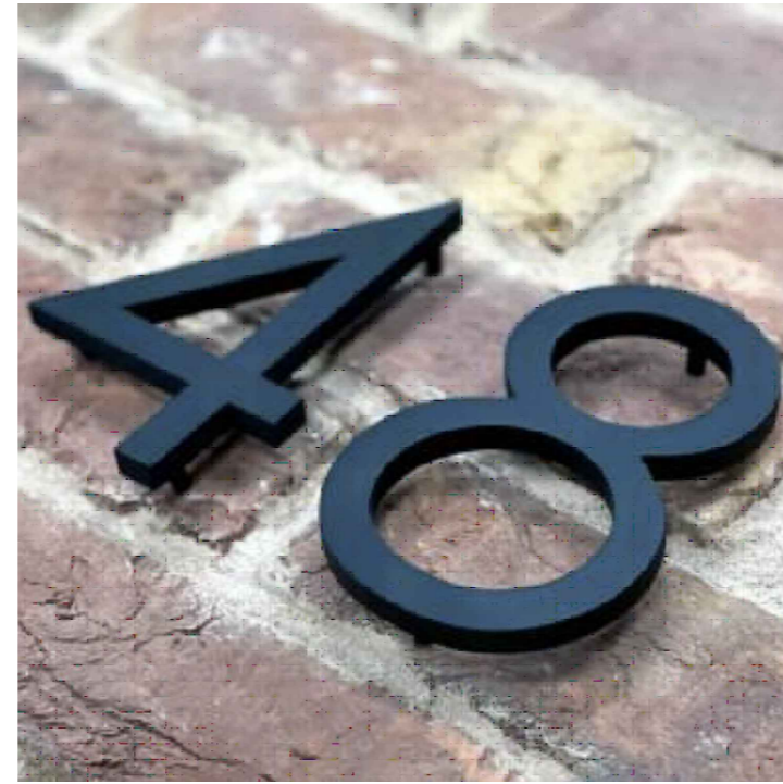
Example of fret cut letters in black pinned off the wall.