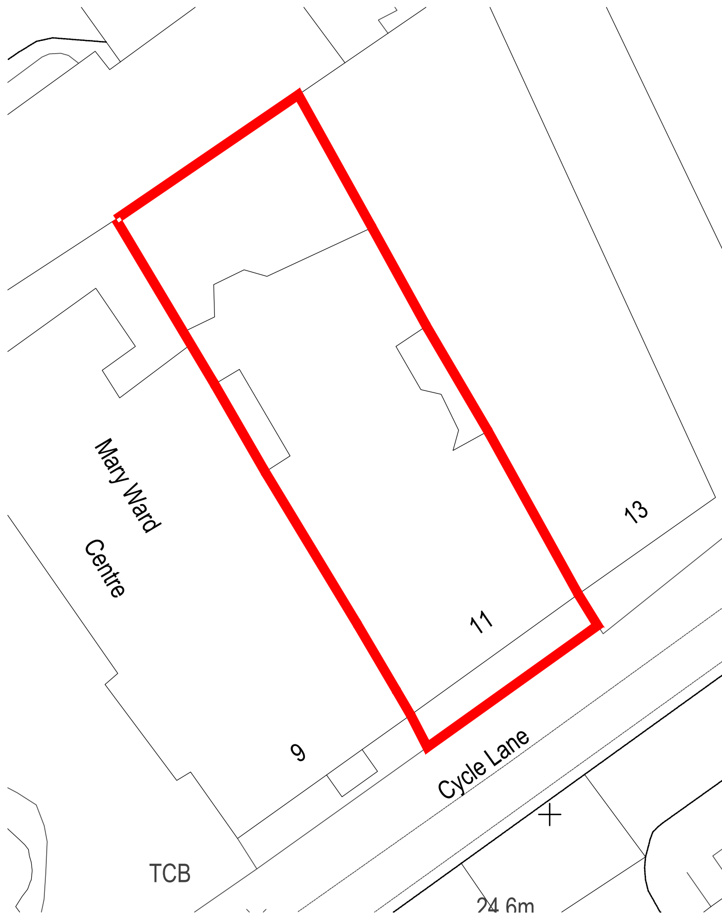
EXISTING SITE BLOCK PLAN SCALE 1:200

Ordnance Survey (c) Crown Copyright 2023. All rights reserved. Licence number 100022432