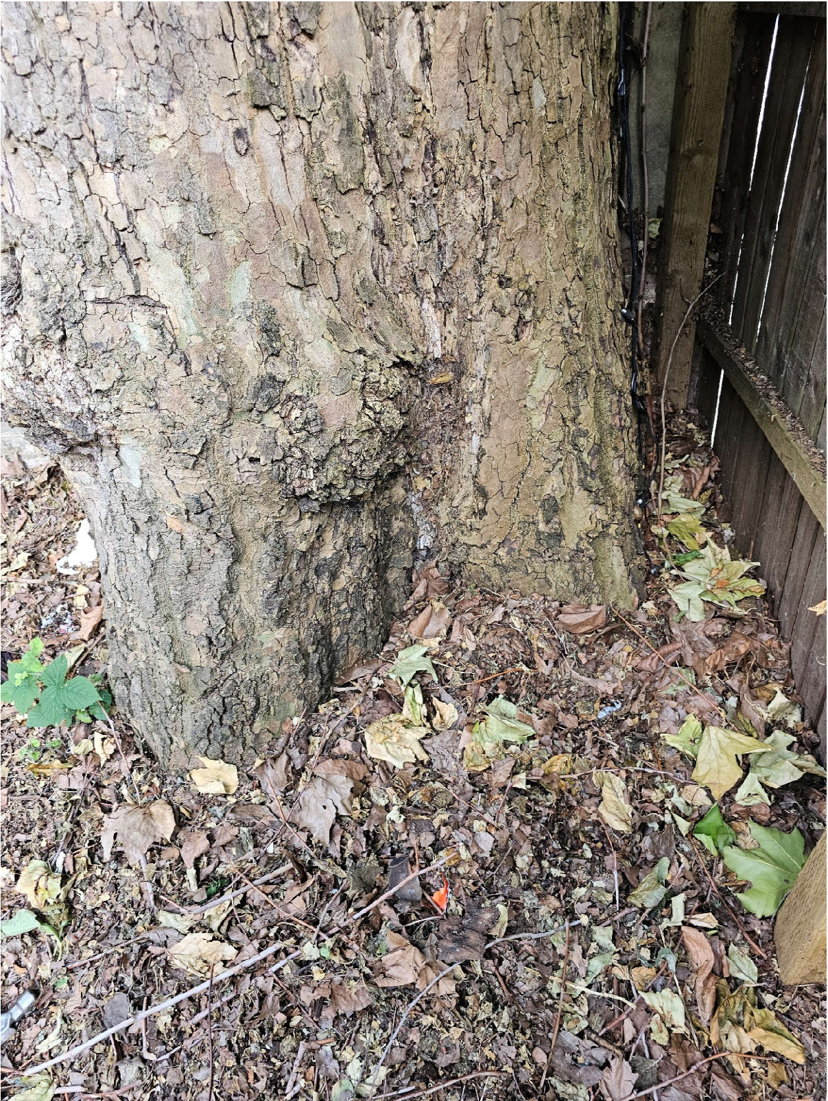
Figure 3 – Decay at the base