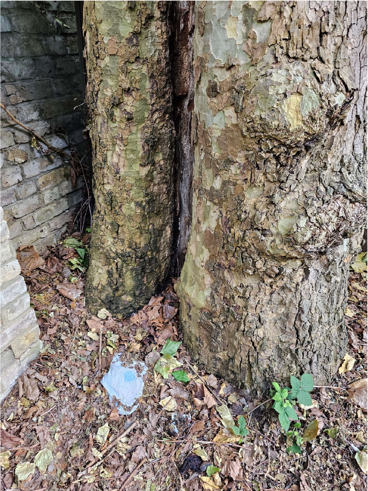
Figure 4 – Extensive cavity on east side decay in roots.