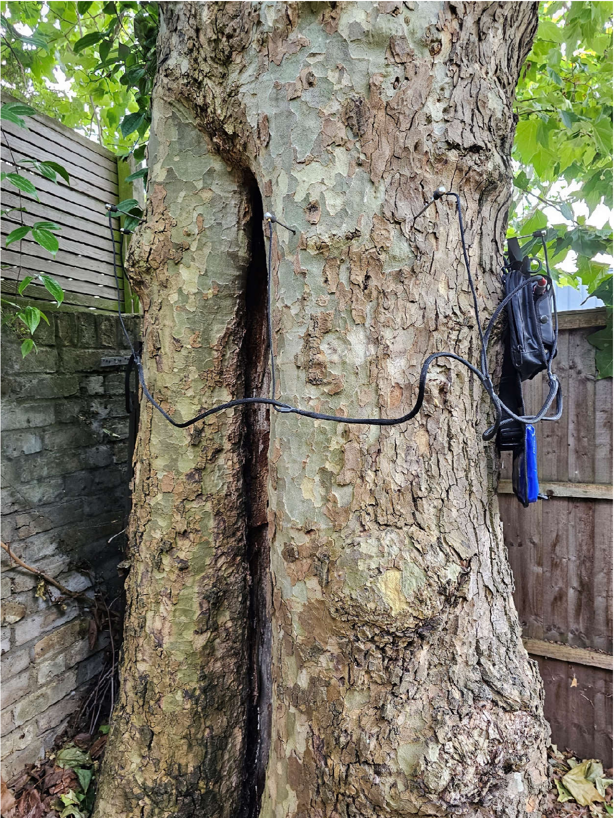
Figure 5 – Picus testing