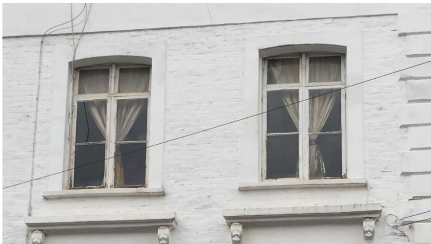
Figure 2: image showing the windows of 26B Healey Road

Figure 2 below illustrates the current state of the windows on the property: