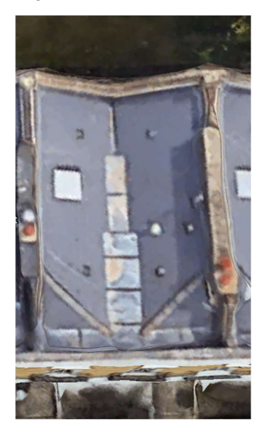
Figure 2 - Butterfly Roof