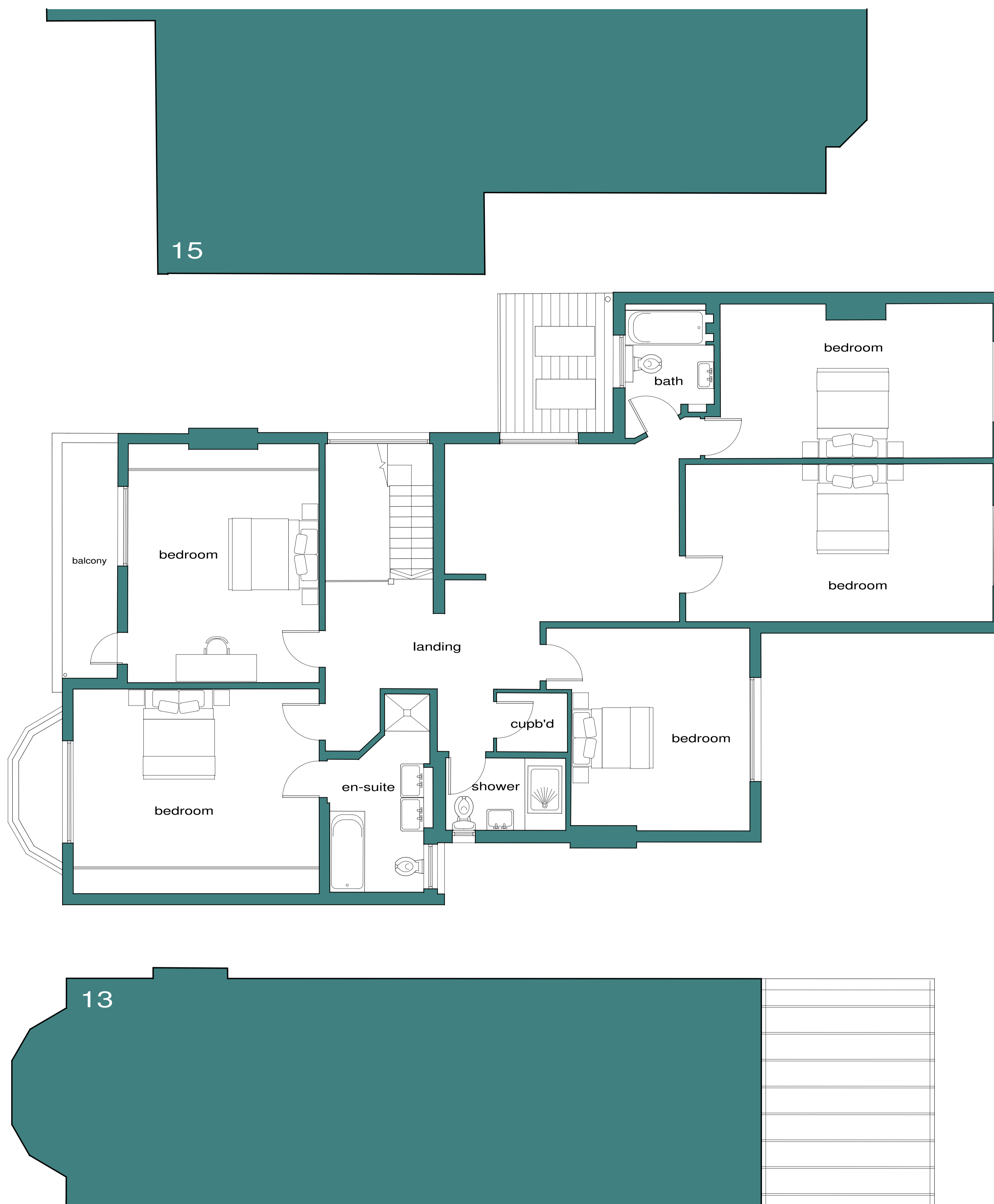
existing first floor plan