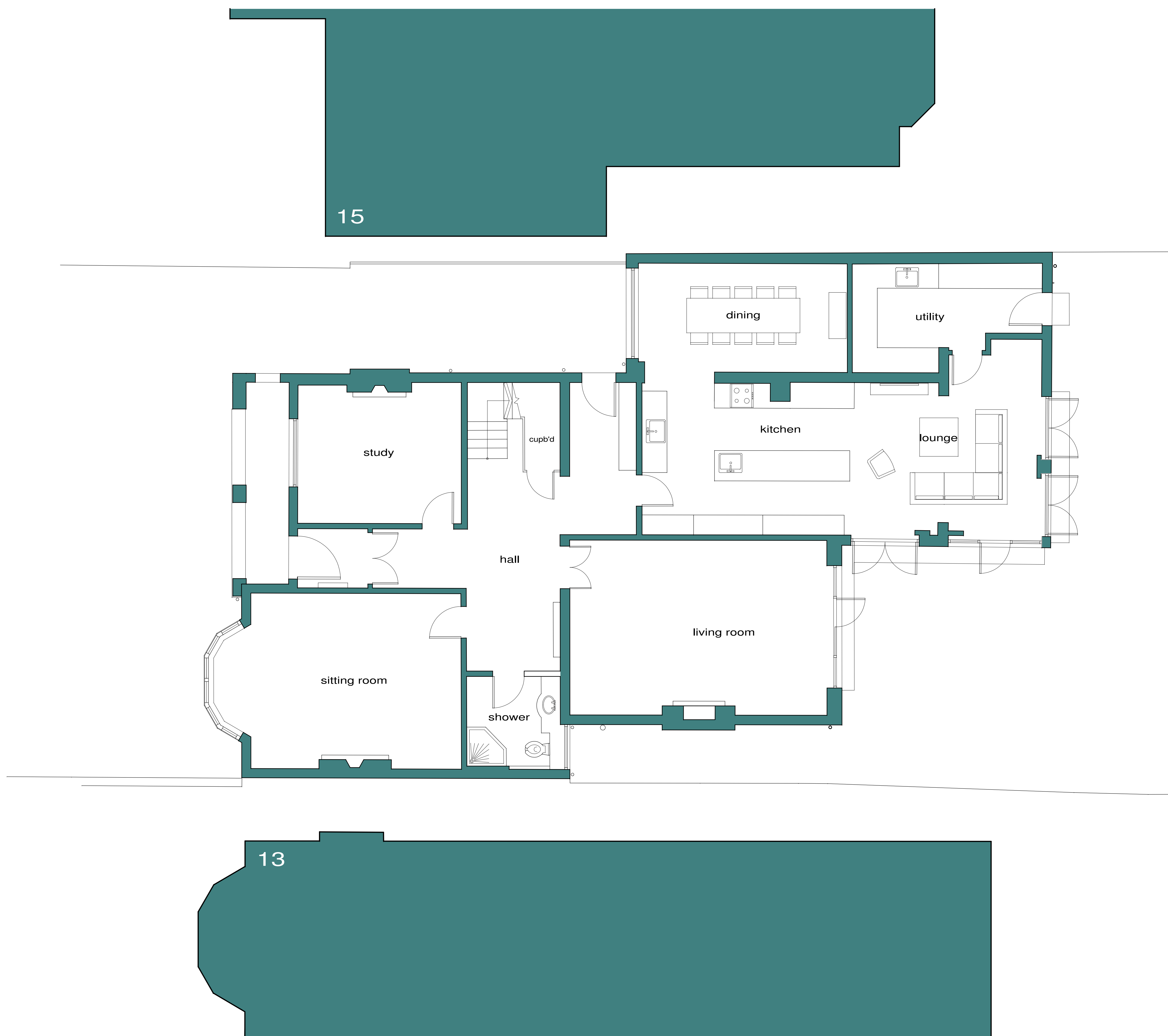
existing ground floor plan