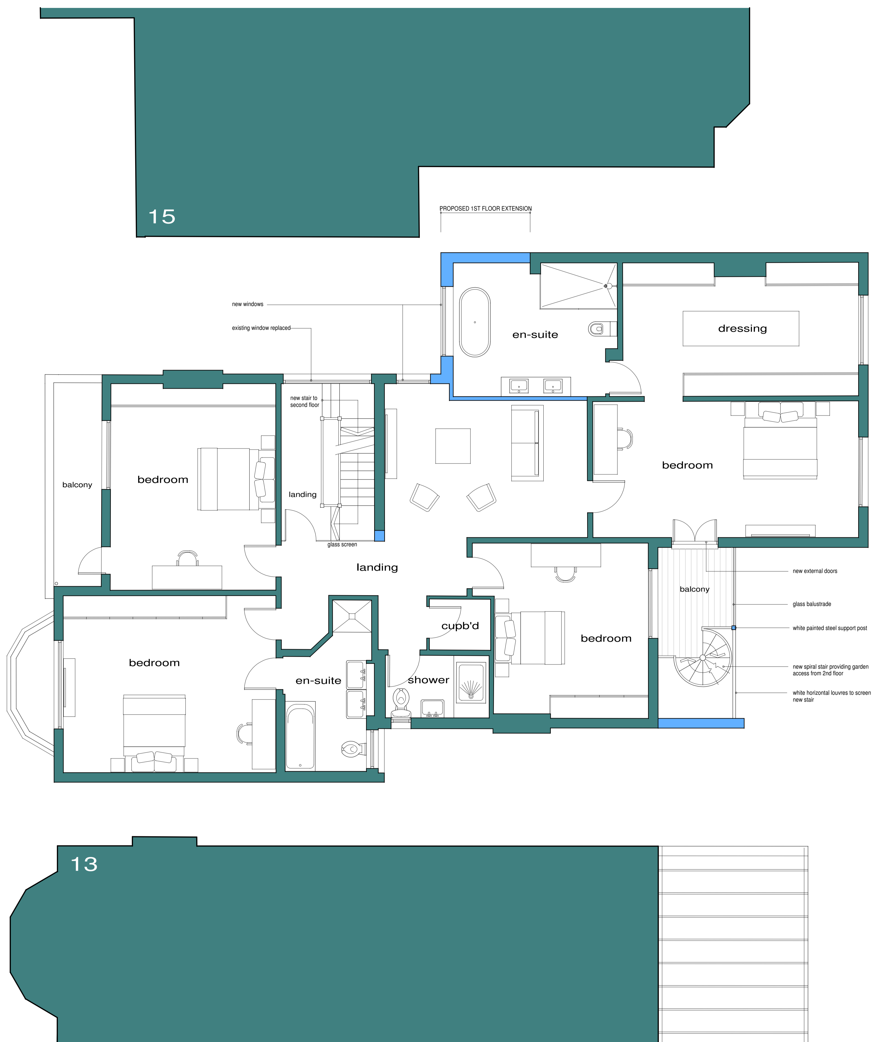
proposed first floor plan