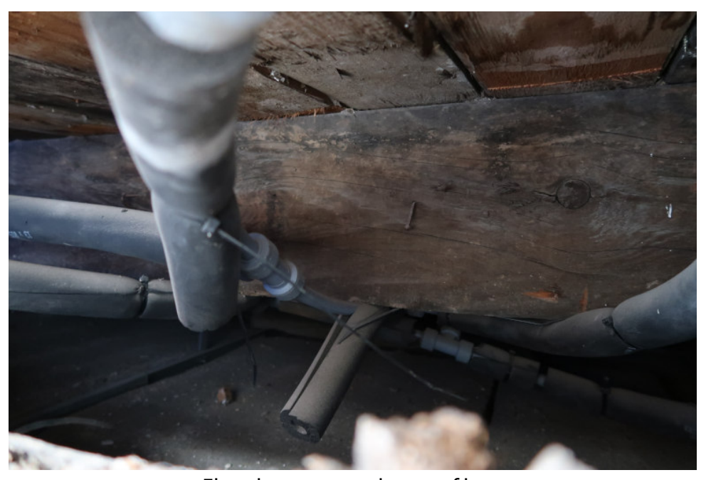
Floor beam towards rear of bay.