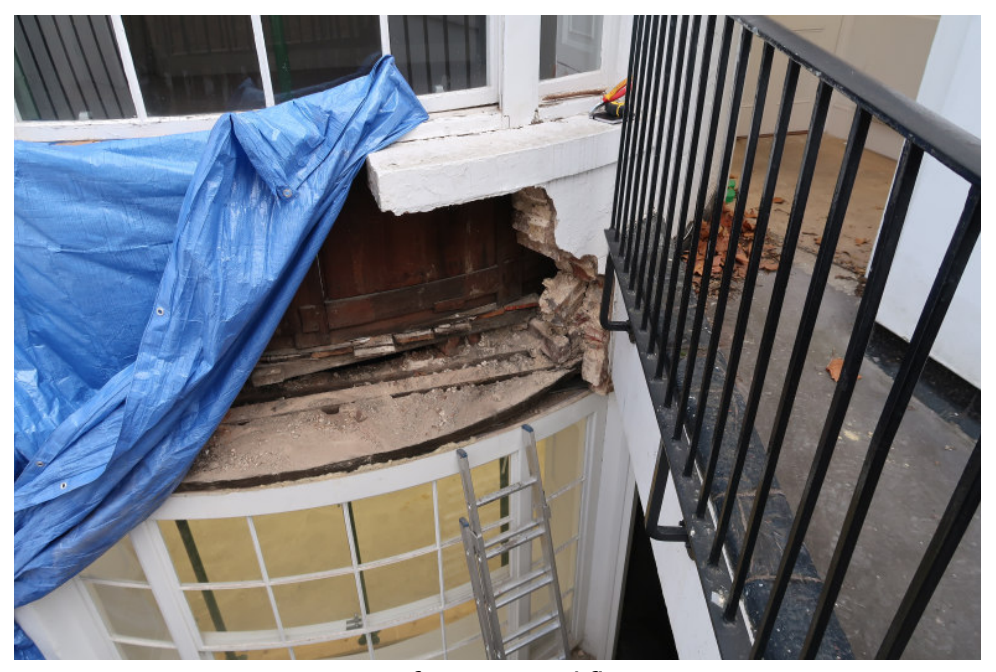
View from ground floor.