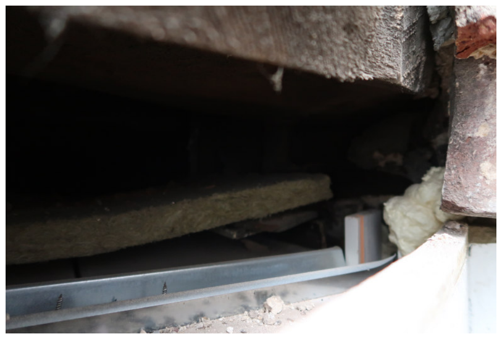
At RHS support.