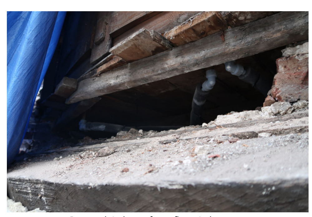
Dropped timber at front, floor timber over.