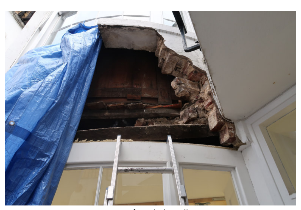
View from lightwell.