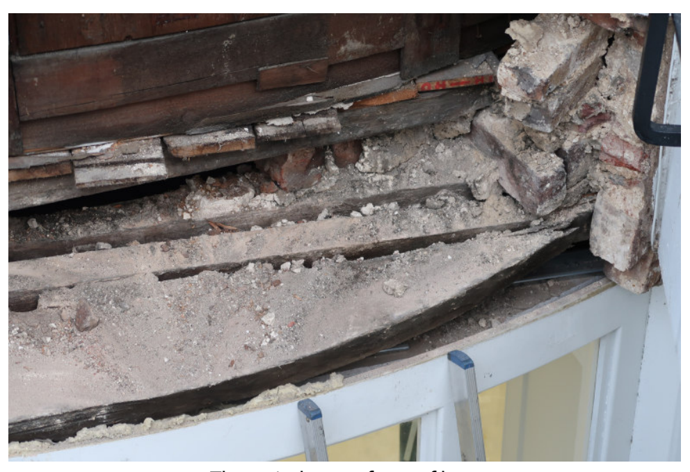
Three timbers at front of bay.