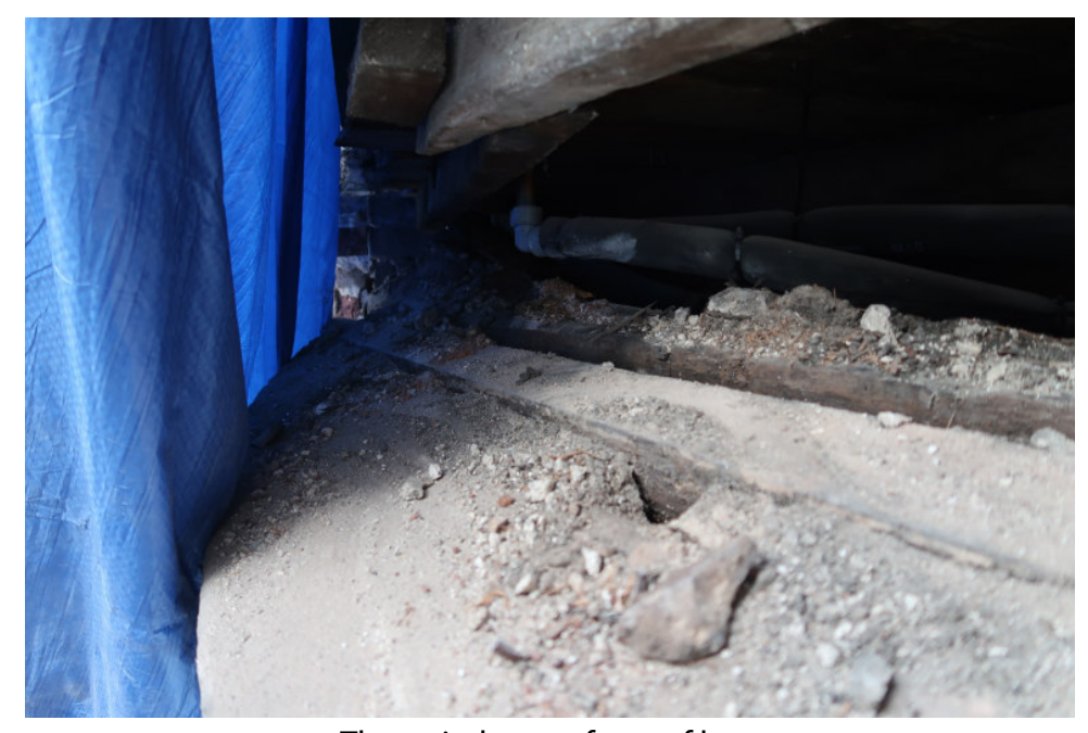
Three timbers at front of bay.