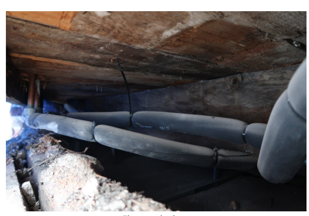
Floor to the bay.