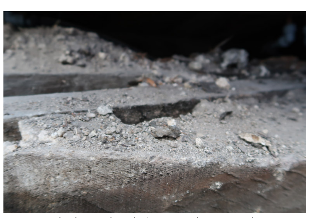
The three timbers don't appear to be connected.