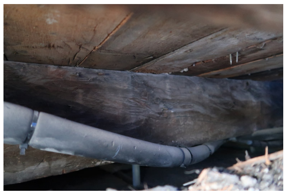
Floor beam behind.