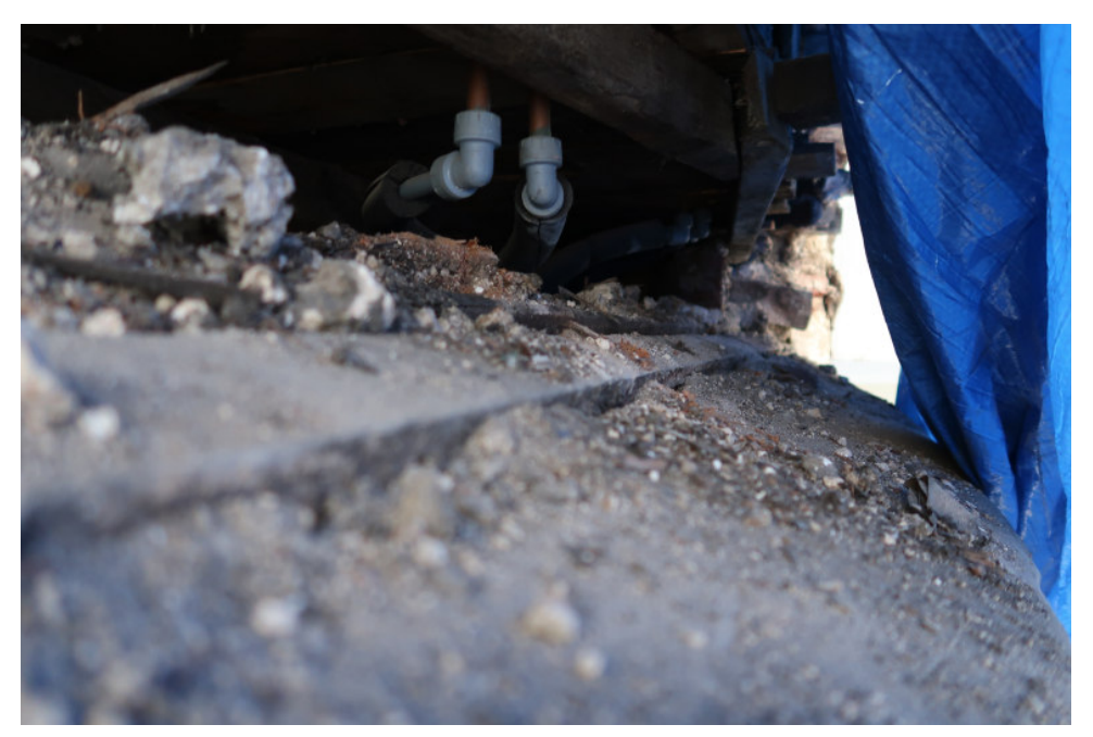
The three timbers at RHS.