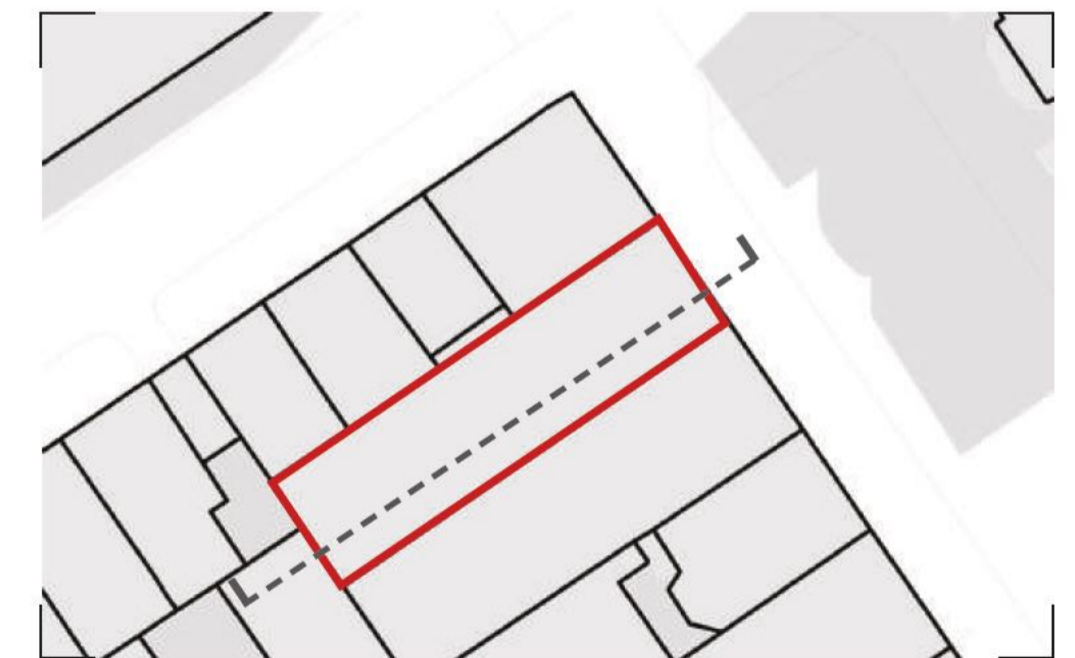
Key Site Plan