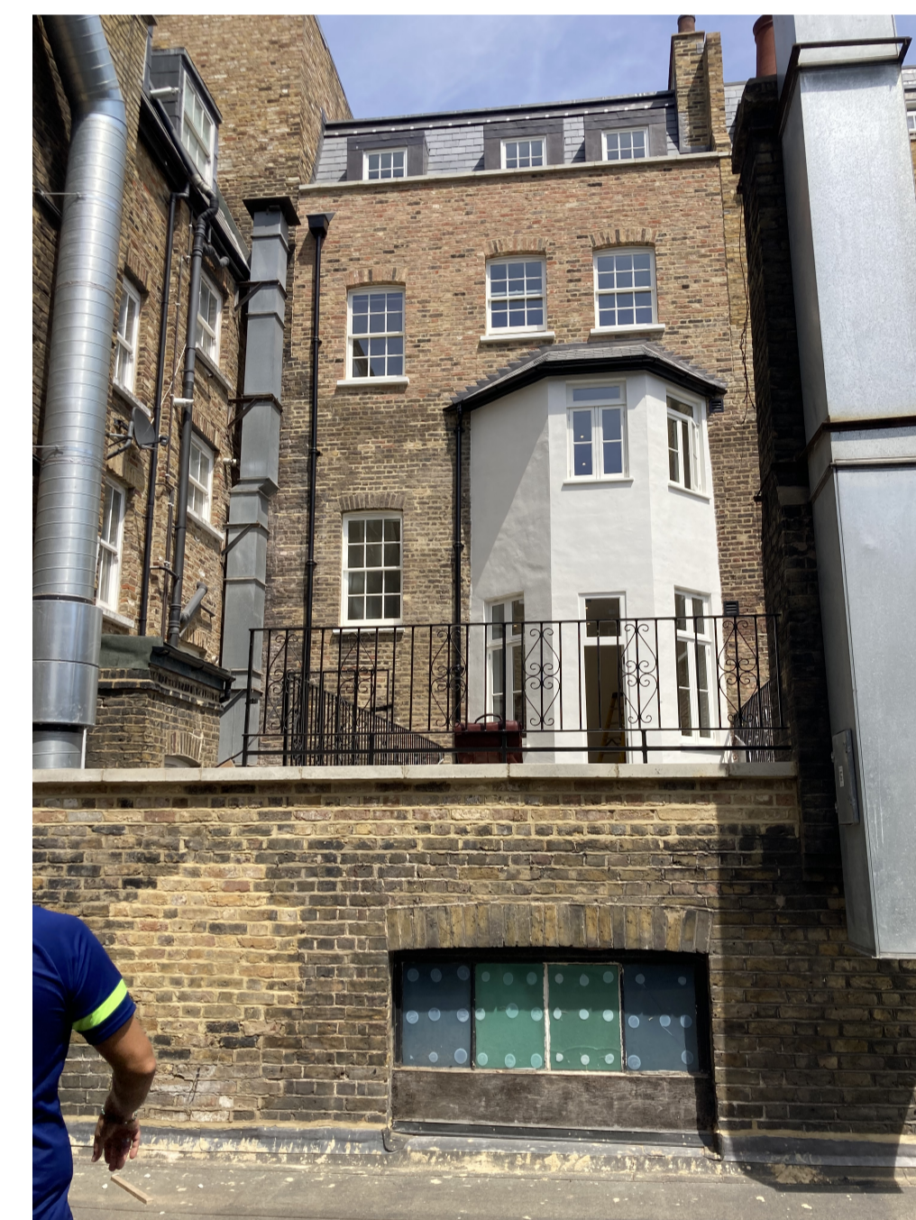
Image of existing blocked off opening - to be retained as it.