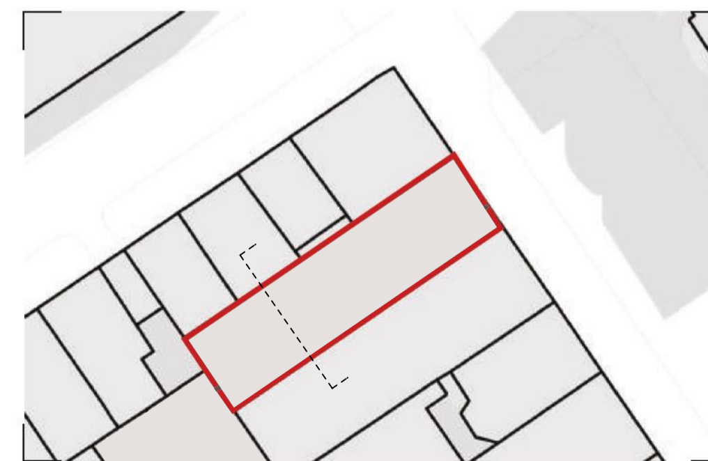
Key Site Plan