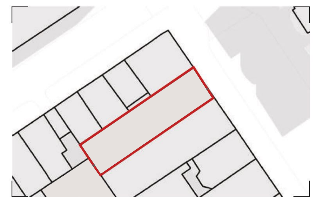
Key Site Plan